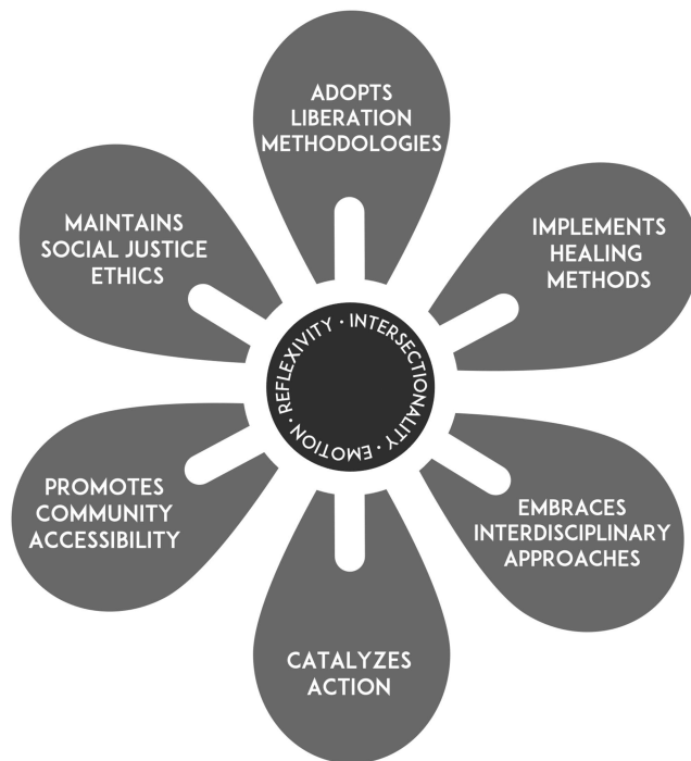
Figure 1 Healing Research Methodologies Framework

intersectionality, and emotion. We understand reflexivity as the practice of identifying our own values and beliefs, examining the ways these impact our perceptions, and evaluating how the research process is affected. We integrate intersectionality (Crenshaw, 1991) throughout, and consider the contexts and ways other oppressed identities interact with race (e.g., gender, class, sexual orientation, and ability). And third, we honor the role of emotions throughout our healing research methodology framework. We acknowledge that healing from racial and other forms of oppression elicits affective responses, and we create space for people and communities to authentically engage in these natural and justified experiences. Further, in addition to creating space for grief and anger, we also hold space for pleasure, joy, love, and triumph in experiencing freedom.