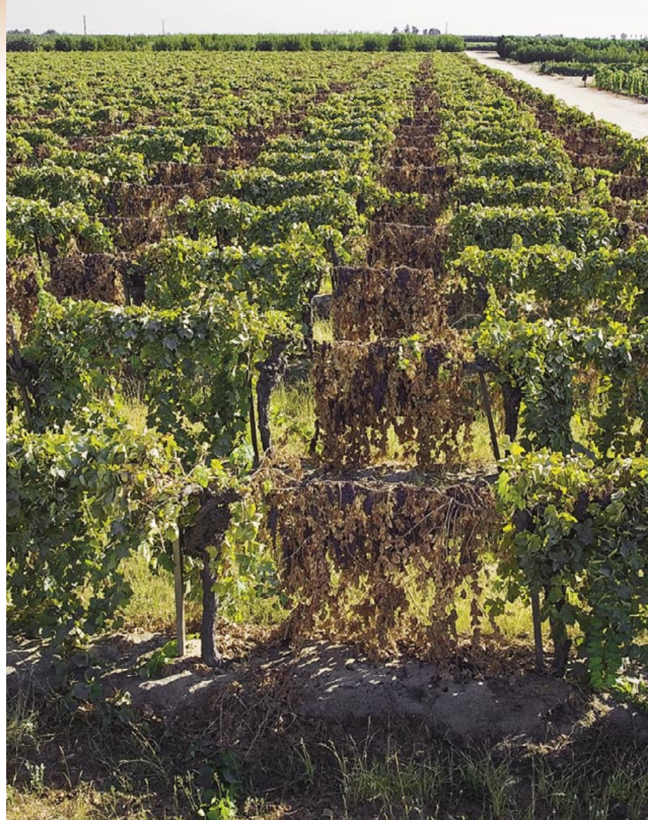
After more than a century of hand-harvesting and drying grapes on trays to produce raisins, California growers now have an economically viable alternative. The alternate bearing, dried-on-vine method (WRAB DOV) developed by Kearney scientists reduces production costs and can be used with existing trellises.

The traditional method of handharvesting and drying grapes on trays for natural raisins has changed little over the past hundred years. Most hand-harvested raisin grapes are dried on individual paper trays placed on a smooth terrace prepared between vine rows. When drying is complete, the raisins are rolled up in the paper trays, then the rolls are picked up by hand or mechanically and the raisins are dumped into bulk containers for removal from the field. Paper trays are usually disposed of by burning in the field. This process