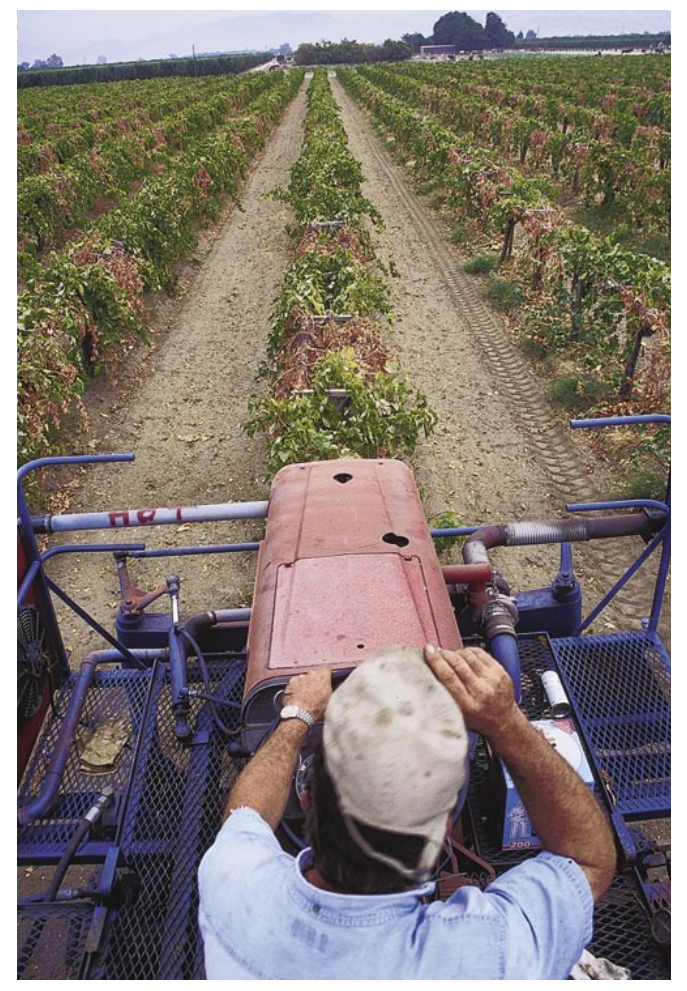
Above, dried-on-vine raisins can be mechanically harvested with a wine grape harvester. Below , hand-harvesting requires much higher costs for labor, paper tray disposal and preparation of clean middle rows.

Research began on the WRAB DOV method in 1999 at KREC. We compared WRAB DOV and traditional tray-drying, measuring yield, raisin quality and harvest costs over 4 consecutive years. Canopy management, summer pruning and harvesting techniques were developed for WRAB DOV. Various trellis widths were evaluated to determine the impact of trellis expansion on yield and vine capacity.