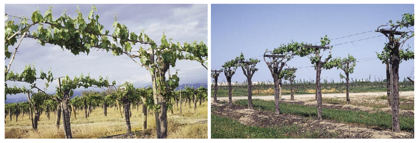
Left , with the traditional method, fruiting canes of 'Thompson Seedless' vines are tied in both directions. Right , with WRAB DOV, fruiting canes and renewal sections alternate down the vine row.

DOV raisins graded higher than tray-dried raisins when at the same fruit maturity. To compare grades, we picked tray-dried fruit on Aug. 21, 2003, and spread it on paper trays. That same day WRAB DOV vines were summerpruned to initiate drying on the vine. Fruit maturity was measured prior to harvest by collecting 150 berries from each treatment, juicing and then measuring soluble solids in degrees Brix (°Brix) with a refractometer. Raisin quality was determined as percentages at "B or better" (BorB) grade, "substandard" grade (sstd.) and mold (mold). Raisin samples were submitted to the U.S. Department of Agriculture's Agricultural Marketing Service in Fresno for testing. The raisin grades were 63% B or better for WRAB DOV raisins and 36% B or better for tray-dried, a 43% improvement in grade (table 1).