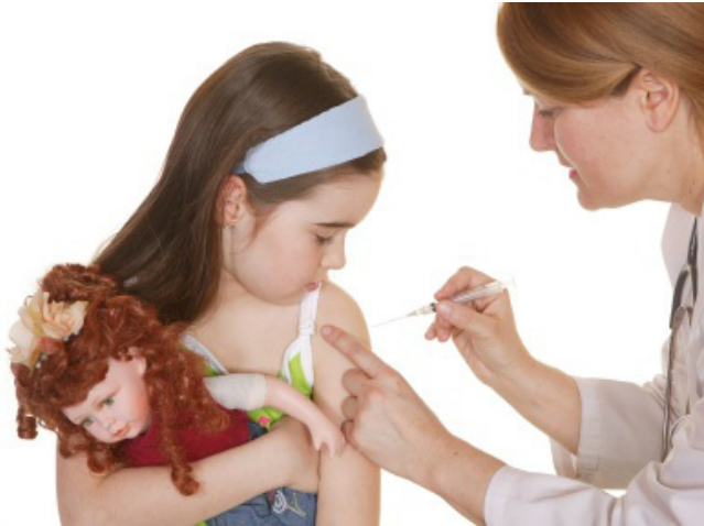
Figure 2. A doctor administers the Human Papillomavirus Vaccine.

milk (Javier and Butle 2008). By the 1960s, with the additional discovery of the murine leukemia virus (MLV) in mice and the SV40 virus in rhesus monkeys, researchers began to acknowledge the possibility that viruses could be linked to human cancers as well. The growing concern over the possibility of human cancer viruses lead to the creation of the U.S. Special Virus Cancer Program in 1964, which was devoted to the search for human oncoviruses.