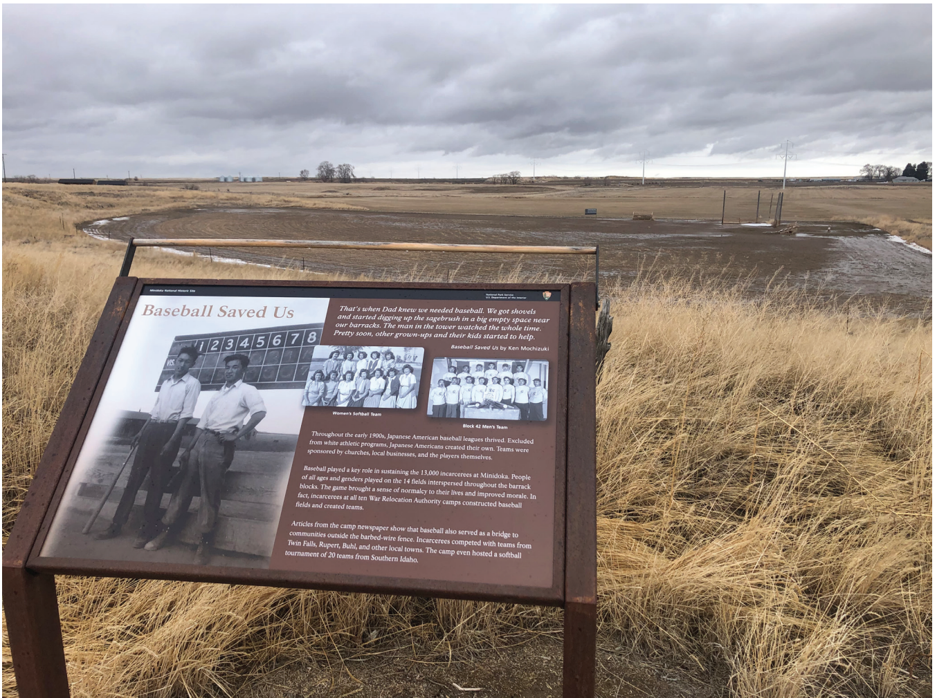
(top) The camp's root cellar: fish-eye view showing construction details. (bottom) Baseball field and signage.

wind farms proposed by Magic Valley Energy, a subsidiary of LS Power: a nationwide investor in, and developer and operator of, clean energy sources. In March 2020, Magic Valley Energy announced the company's plan to develop one of the nation's largest wind farms in southern Idaho, on land mainly owned by BLM and just on the edge of the national historic site. On the highway driving to the turn-off for Minidoka, I saw several survey crews and trucks off in the fields and scrub. Company officials touted the estimates of nearly 700 jobs the project would create during construction and millions in added annual tax revenue to local counties to fix roads and fund schools. 15 At the time, the company was hoping to begin the project as early as 2022, once BLM issued its environmental impact statement (EIS), after a period