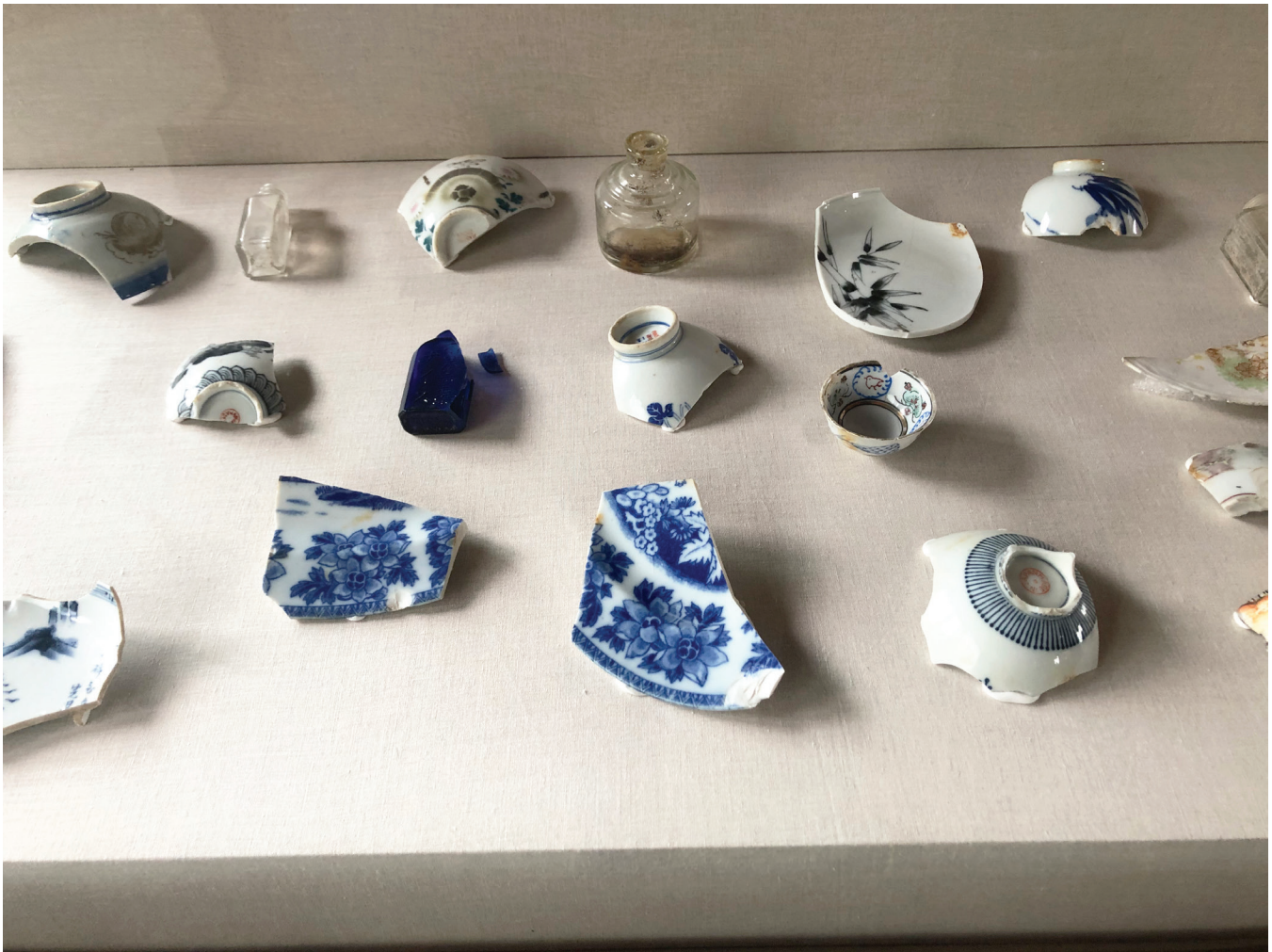
Visitor Center exhibit of ceramic and glassware.