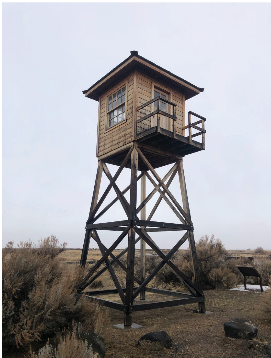
Minidoka guard tower.

Not much changed at the site until recently. In 2001, President Bill Clinton utilized the Antiquities Act to designate 73 acres of the original site the Minidoka Internment National Monument. The National Park Service (NPS) then developed a general management plan for the site, lobbying for the acquisition of more land, the reconstruction of former structures, such as living quarters, and a change in the site's official name. At the time, the official name, the Minidoka Internment National Monument was not in line with that of the agency's other related site, Manzanar National Historic Site. The term "Internment" was unacceptable to some Japanese Americans and their organizations like the Japanese American National Museum who use "concentration camp" to define the American World War II civilian incarceration sites. In 2008, Minidoka was redesignated as a national historic site. Thus its name was changed,