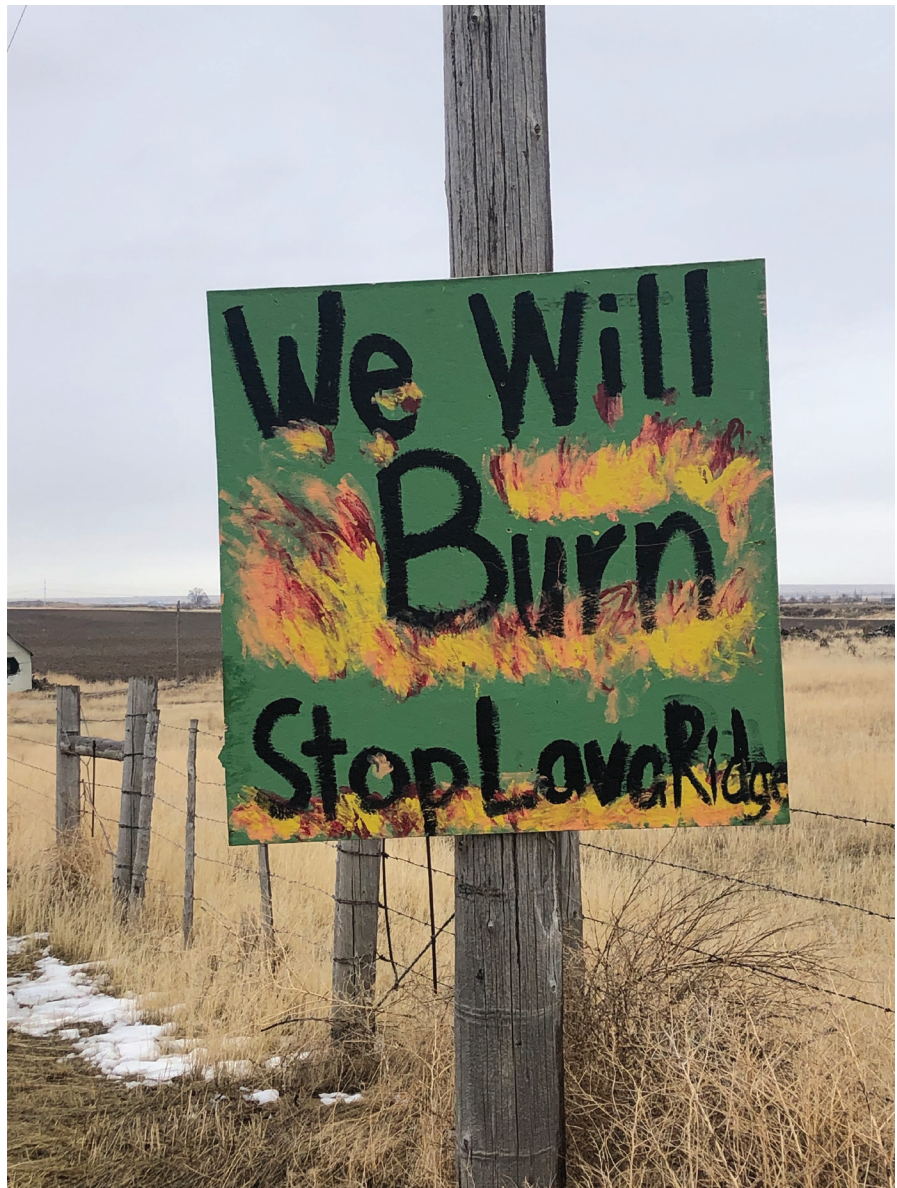
Protest sign near Minidoka National Historic Site. ROBERT T. HAYASHI

In the meantime, Magic Valley Energy began to hold public hearings in the local area, and as the scale and possible impact of the project became clearer, local opposition grew. The public began to raise concerns especially about the potential environmental footprint of the wind farm. The company revealed that the project would span 76,000 acres and include as many as 400 wind turbines, with some as tall as 740 feet, and require 381 miles of service roads and the building of related energy transmission and storage infrastructure. 16 The proposed site includes habitat for the rapidly declining sage grouse, as well as pheasant and other birds of prey. It also included a grazing allotment that local ranchers have relied on for a century. The company was vague about the actual consumer of the project's energy—specifically, whether it would benefit local consumers or out-of-state markets.