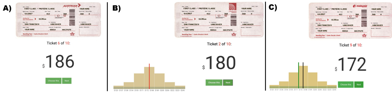
Figure 1: Screenshots of the Test Phase of the Three Experimental Conditions

Note. A) Baseline condition. The information available to participants is the current ticket price and the position in the current sequence. B) Distribution condition. In addition to the information in the Baseline condition, participants are shown the distribution of ticket prices as a histogram and the position of the current ticket price in the distribution (in red). C) Optimal condition. In addition to the ticket price distribution and the current ticket price, participants are also shown the position dependent optimal threshold in black. If the current price is better than the threshold, it was shown in green (as here), otherwise it was shown in red. Not shown: The current trial number was displayed in the top left throughout in all conditions: “Sequence x of 200”.