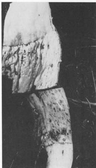
FIGURE 2. Bud-union crease and xyloporosis-like wood pitting on trifoliate orange rootstock with Washington Navel orange top.