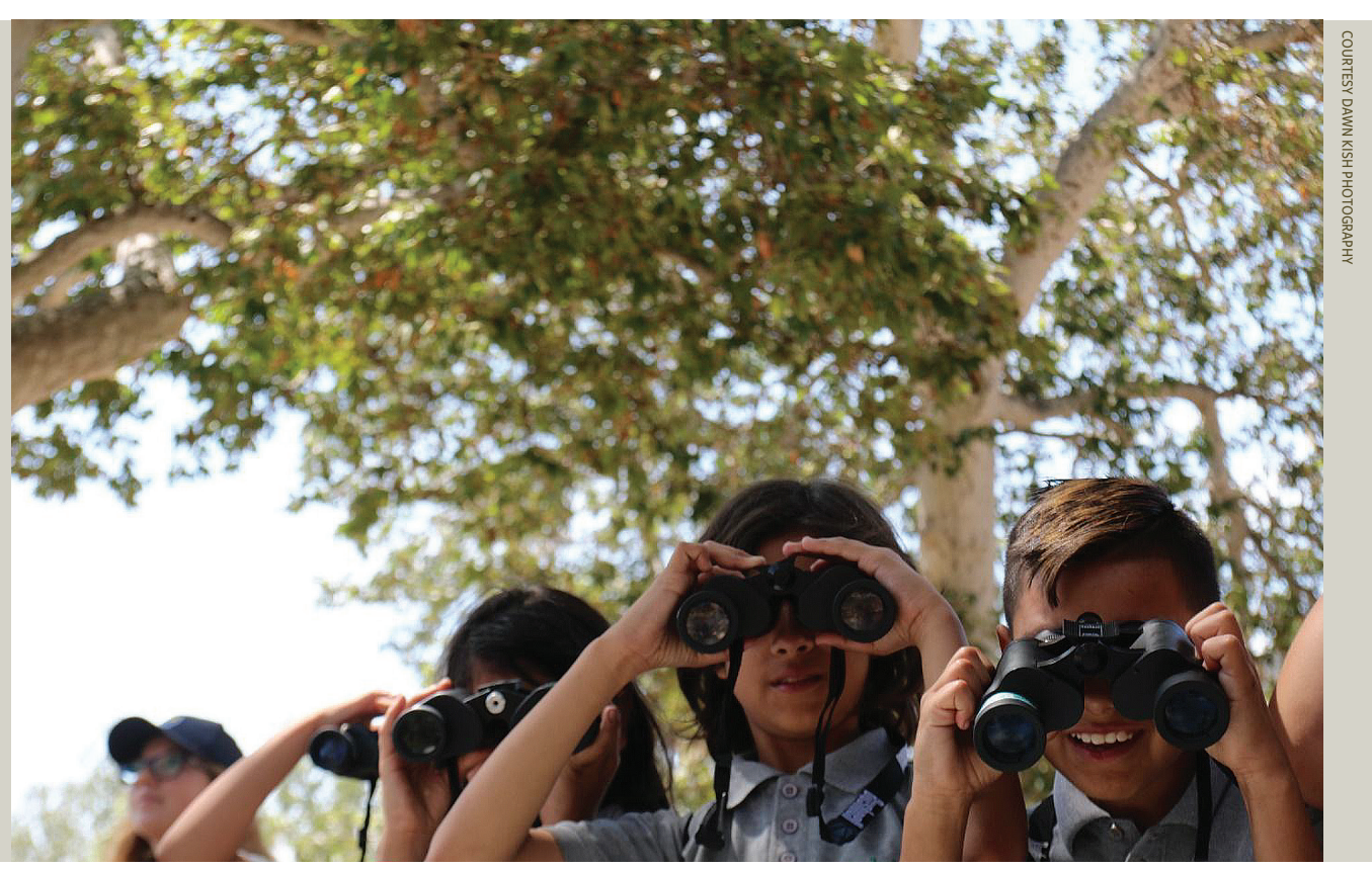
Open OutDoors for Kids participants utilizing binoculars for scientific observation, Santa Monica Mountains National Recreation Area.