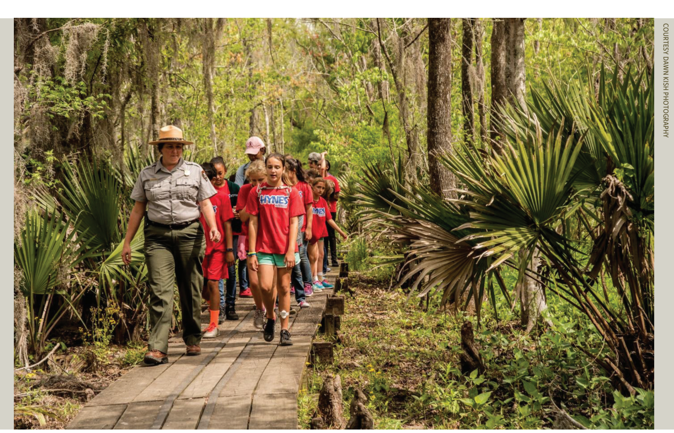
NPS ranger introduces students to the natural and cultural resources of Barataria Preserve, Jean Lafitte National Historical Park and Preserve, just outside New Orleans.

During the 2018–2019 school year, over 207,000 children visited 132 national parks across the country (Applied Research Northwest Final Report, 2019a) as part of Open OutDoors for Kids. As an example, in an Open OutDoors for Kids program in Pecos National Historical Park, New Mexico, rangers worked with fourth graders from nearby communities. The rangers shared information about the site and helped the students make connections to their studies and home lives. During the program, called "Creating Connections to the Ancestors: Northern New Mexico 4th Graders Discover their Past at Pecos," rangers visited each classroom five times to provide background information on biological, natural, and historical topics students might encounter in their visit to the park. Then, the students visited the park, became junior rangers,