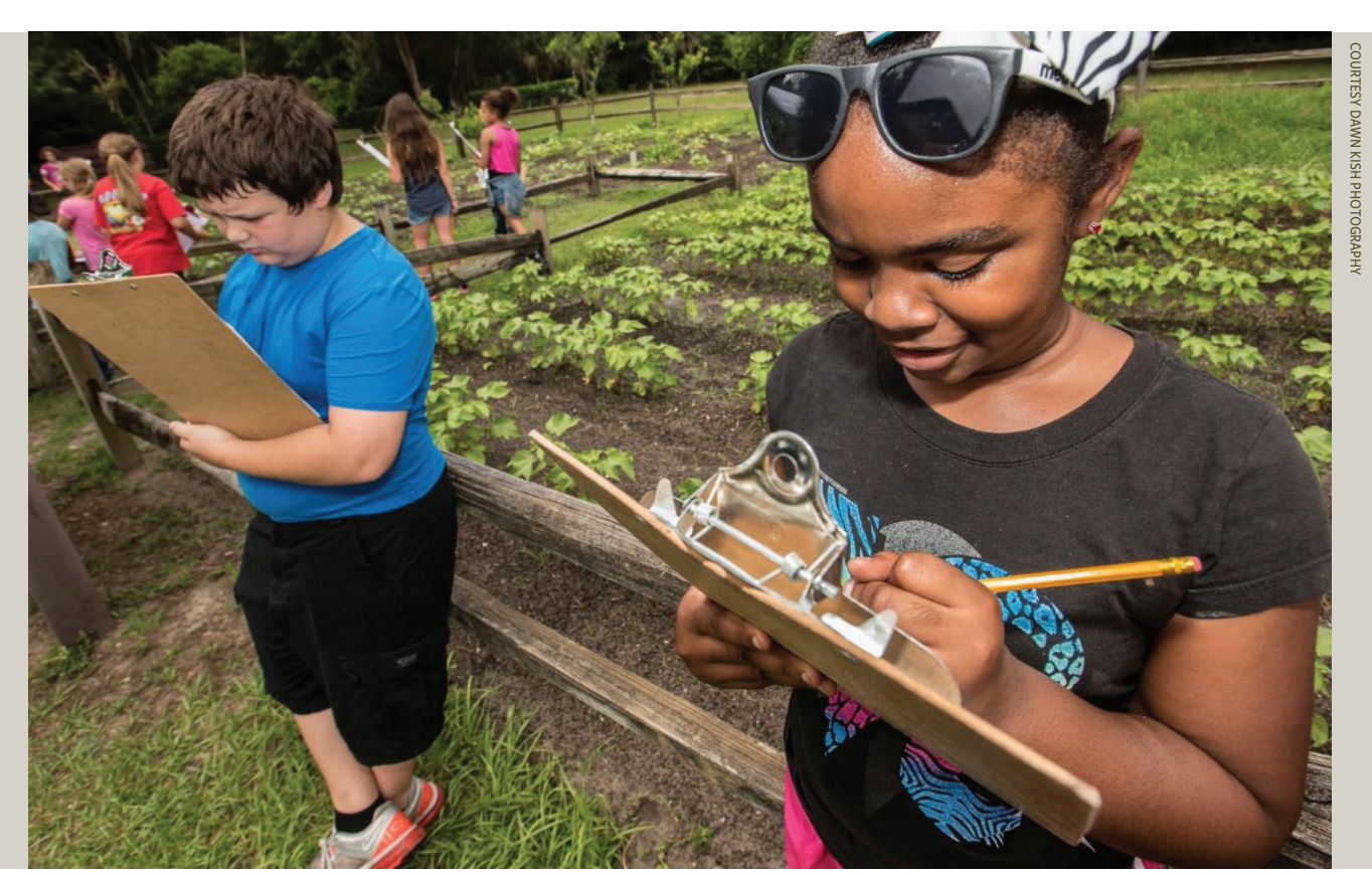
Students note their observations in the field at Kingsley Plantation, Timucuan Ecological and Historic Preserve (USNPS), near Jacksonville, Florida.

percent said they definitely would come back and another 19% said they probably would come back (Applied Research Northwest 2019b). Though the program's evaluation reports query only intention to return, research studies on increasing inclusion on public lands suggest factors that contribute to these responses. These include the fact that (a) students can envision themselves in parks, (b) activities are carefully planned to be accessible and provide students with skills and knowledge necessary to accomplish them, and (c) park staff are welcoming and inclusive (Markle et al. 2019). A teacher participant who participated in an Indiana Dunes National Lakeshore [now National Park] field trip supported these points saying, "The park did great on building relationships with kids and helping kids build an understanding, and even a love for, nature" (Applied Research Northwest 2019b: 26).