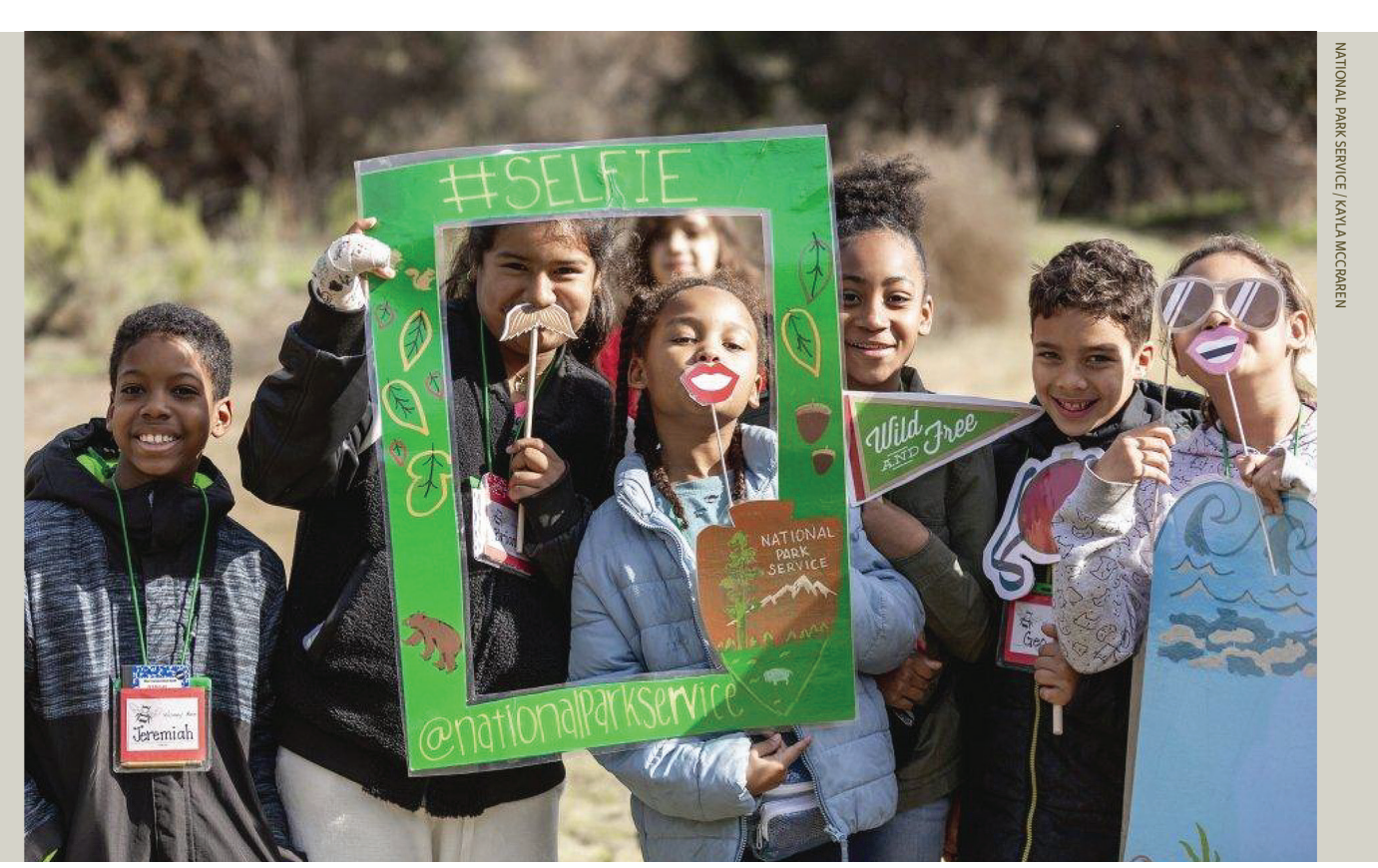
Open\ Out Doors\ for\ Kids\ participants\ enjoying\ their\ field\ trip\ to\ Santa\ Monica\ Mountains\ National\ Recreation\ Area.