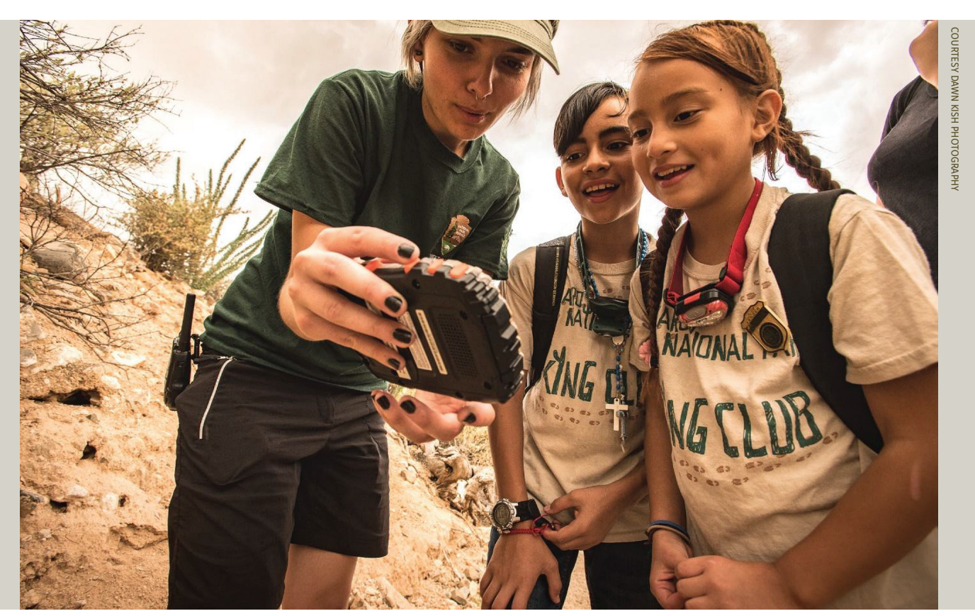
Field trip participants to Saguaro National Park.