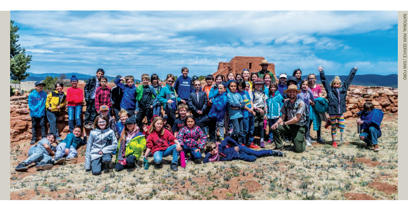
School kids celebrating a field trip to Pecos National Historical Park

and learned about the history of the site as they participated in educational activities with rangers and volunteers. More than 100 students were able to participate in this program.