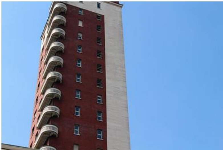
Fig. 6. “Torino - Torre Littoria”