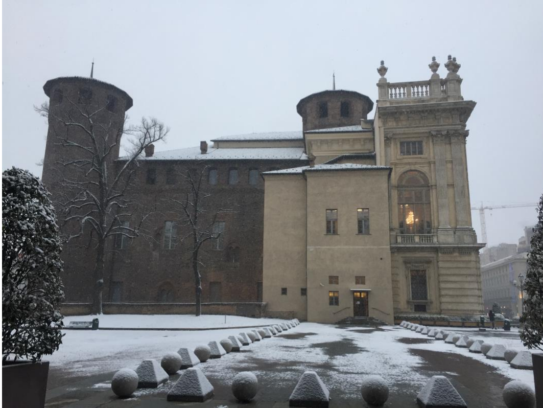
Fig. 7. Mixed architectural periods of Palazzo Madama.