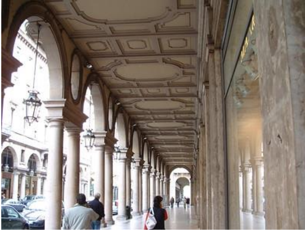
Fig. 1. “Via Roma Arcades”