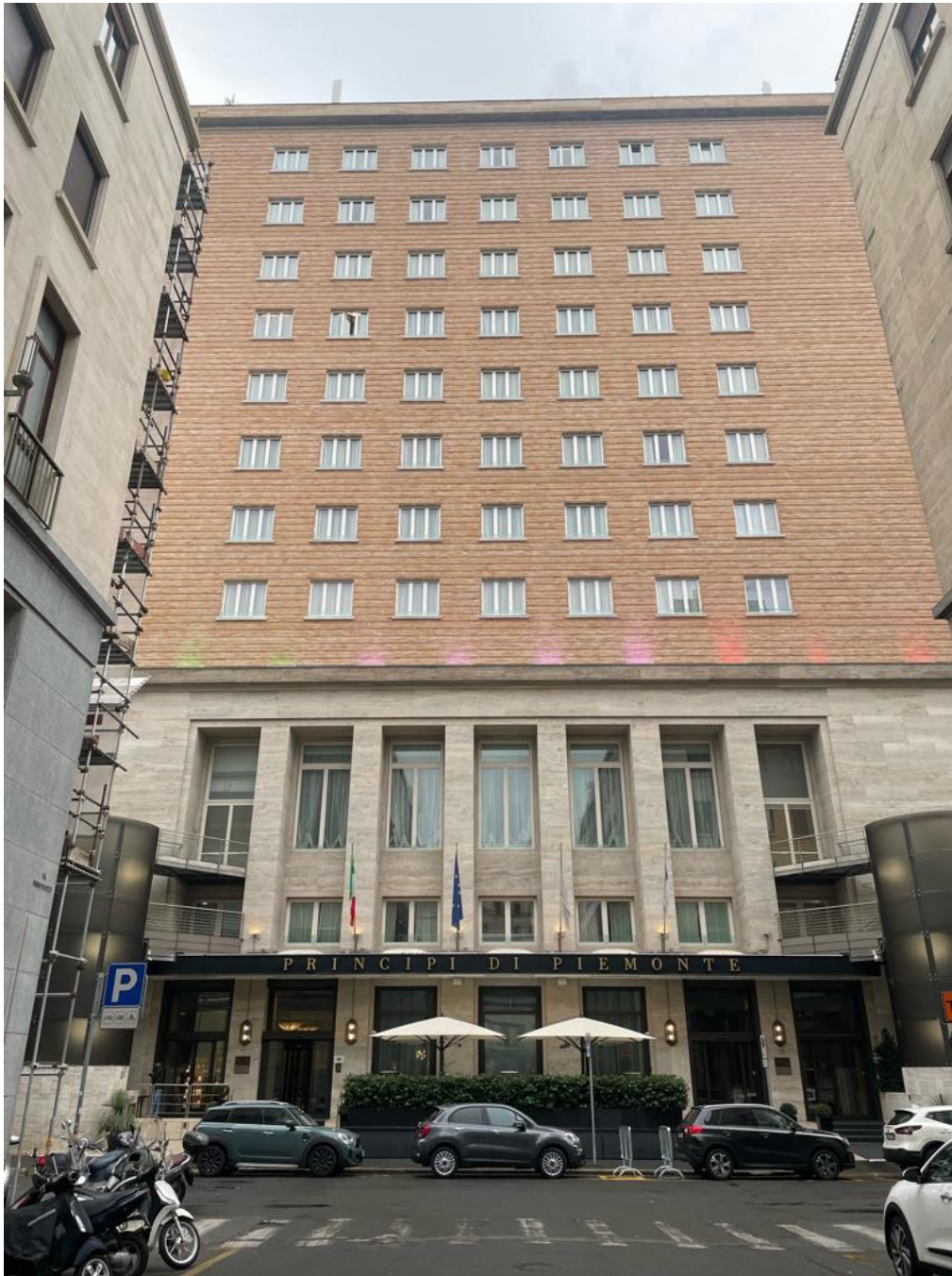
Fig. 9. The Grande Albergo Principi di Piemonte.