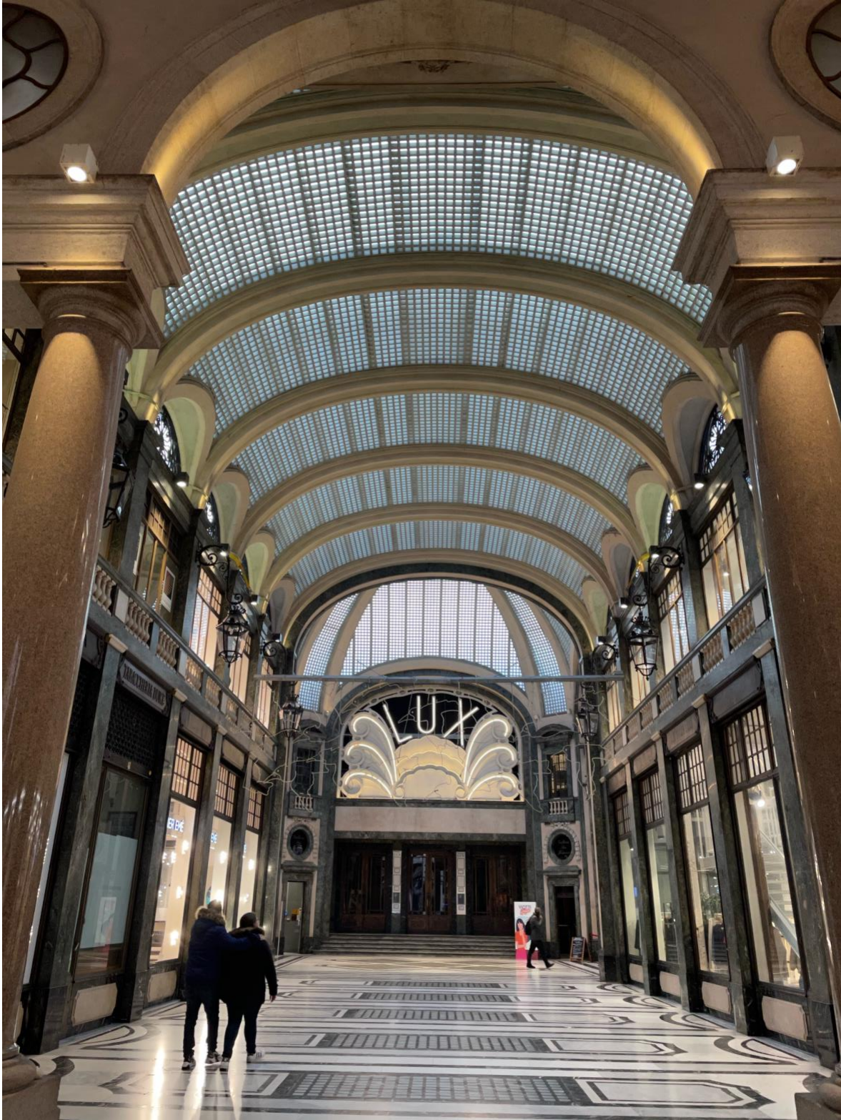
Fig. 3. View of the “Lux” movie theater (formerly “Dux”) with the vaulted glass ceiling of Galleria San Federico.