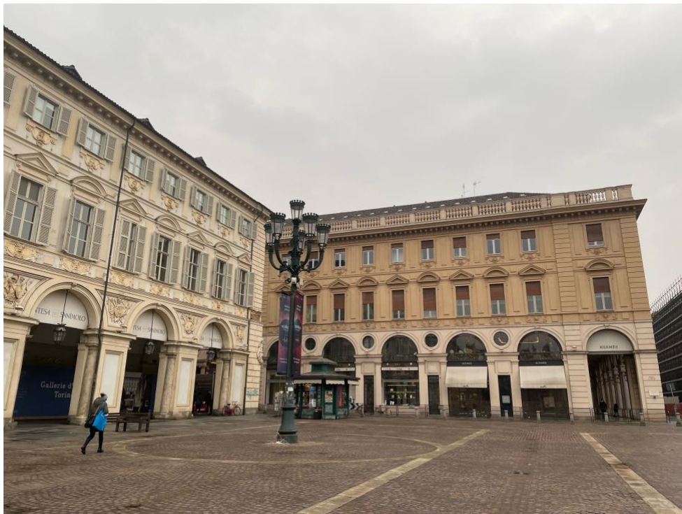
Fig. 2. The seventeenth-century baroque Piazza San Carlo (left) and the twentieth-century imitation of the architectural style on the new Via Roma (right).