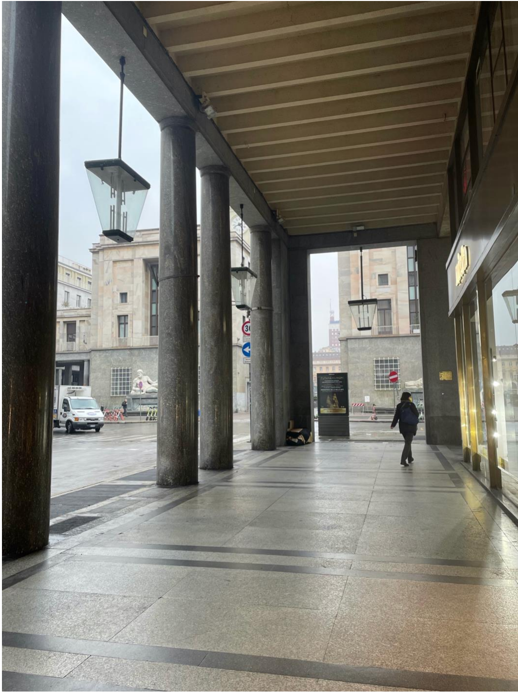
Fig. 10. The porticoes of the second section of Via Roma.