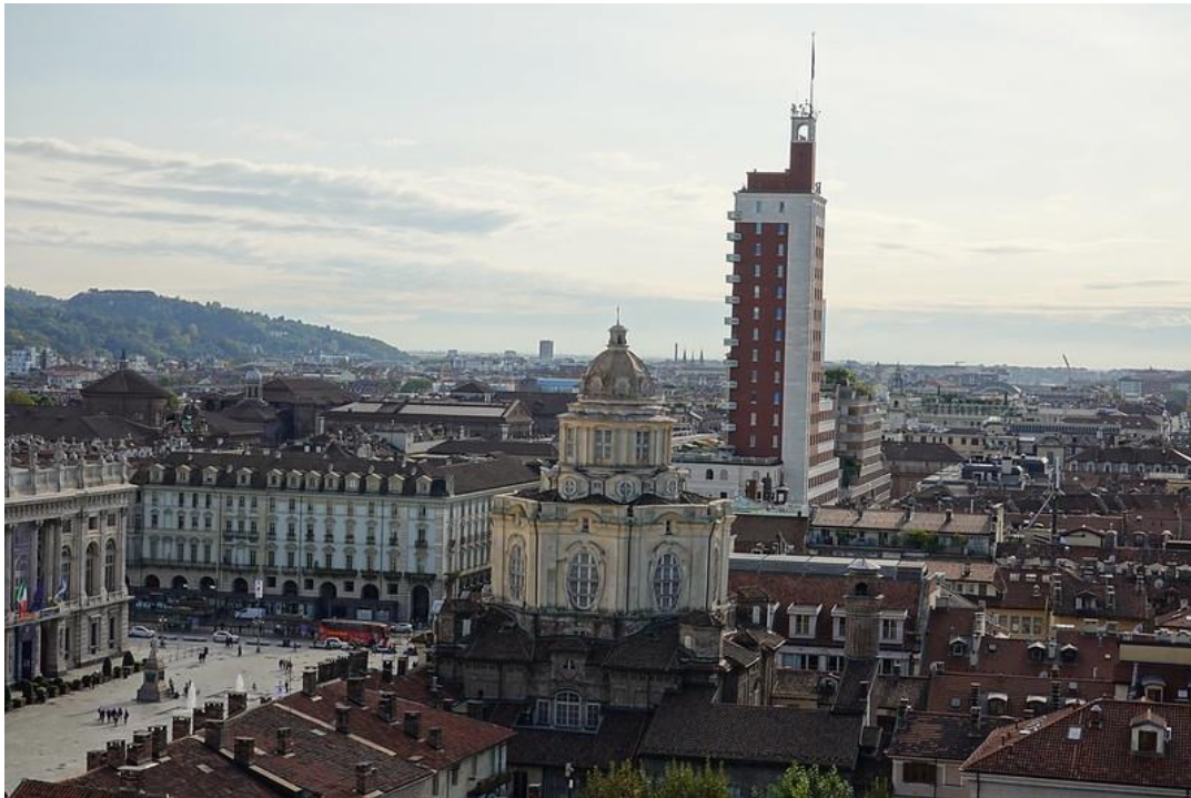
Fig. 8. “Torre Littoria @ Tower observatory @ Cattedrale di San Giovanni Battista @ Turin”