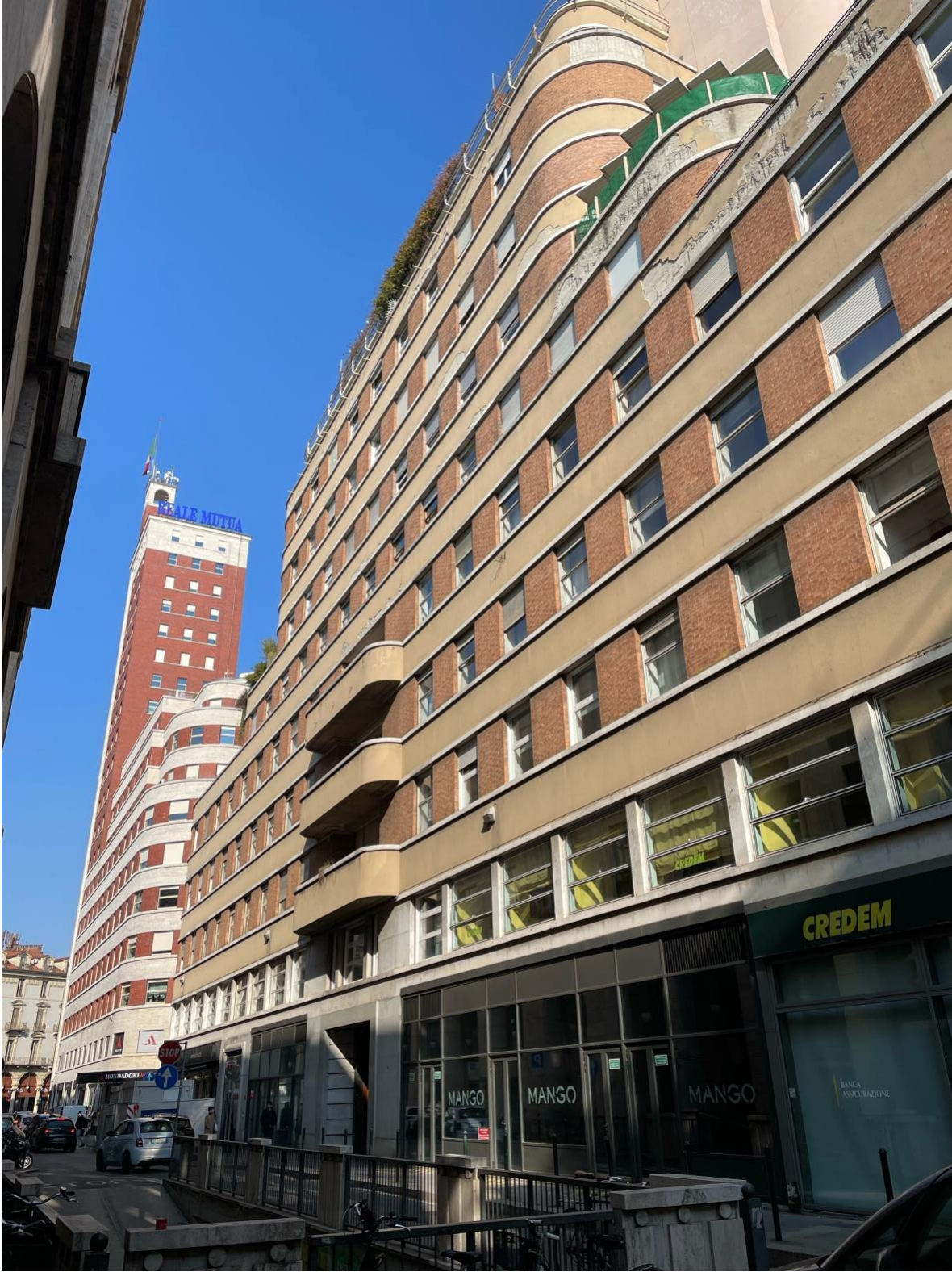
Fig. 4. The rear facades along Via Viotti the San Vincenzo and Sant'Emanuele blocks.