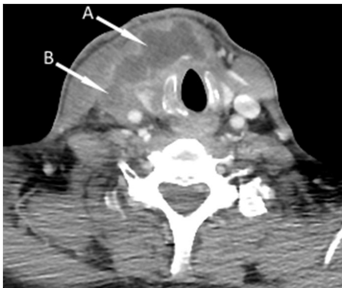
Image 2. Contrast-enhanced computed tomography of the neck showing a soft tissue fluid collection (A) anterior and lateral to the trachea, and thrombus in the right internal jugular vein (B)

of the infectious disease service, the patient's antibiotic regimen was changed to ampicillin/sulbactam. The patient was discharged on hospital day 11 to complete a six-week course of antibiotic therapy with ertapenem and anticoagulation with enoxaparin. A contrast-enhanced CT of the neck performed 20 days after the initial scan showed no significant change in the right IJ vein thrombus. Ultimately the patient underwent total laryngectomy for treatment of his malignancy.