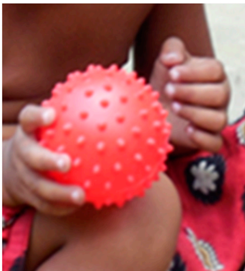
FIGURE 1. Sentinel toy. This figure appears in color at www.ajtmh.org .

The samples were stored at 2–8°C and analyzed to detect fecal coliforms within 24 hours of collection. The toy rinse samples were processed using the membrane filtration technique. Because the method of enumerating fecal indicator bacteria from rubber toy balls was used in two previous studies in similar settings, we did not conduct a validation of