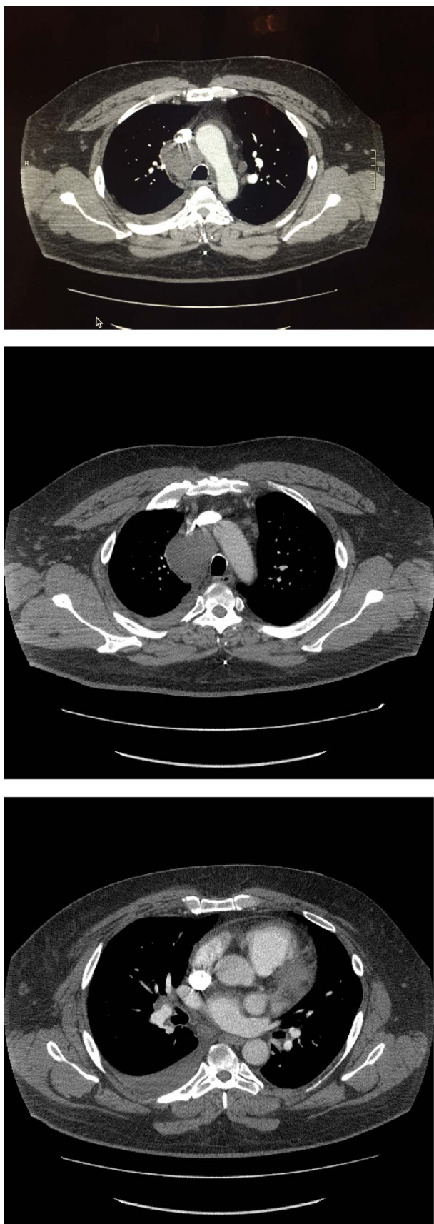
Fig. 1. CT scan showing a paratracheal mass with hilar adenopathy and a pleural effusion.

read of the outside CT suggested the presence of a PE, which helped explain the hilar and mediastinal adenopathy and pleural effusion. Due to concern for PE, a repeat PE protocol CT was performed showing no evidence of a current PE; furthermore, it showed resolution of the ipsilateral pleural effusion and hilar and mediastinal lymphadenopathy. The cyst was reduced to from 6 cm to 3 cm following drainage (Fig. 3). Since undergoing EBUS guided TBNA, our patient has reported a good functional outcome with total resolution of his symptoms and greatly improved exercise tolerance.