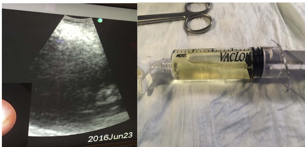
Fig. 2. Doppler US image and syringe with fluid aspirated from the paratracheal mass.