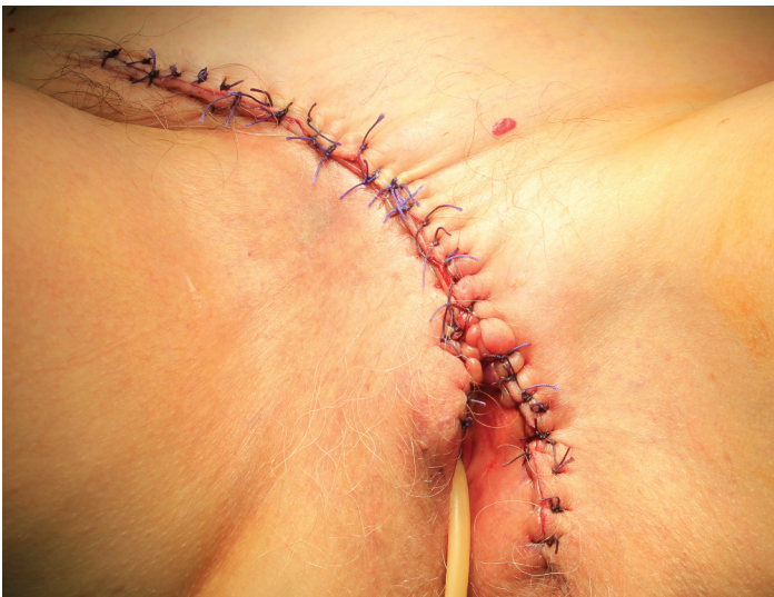
Figure 4. Immediate post-operative aspect after simple vulvectomy with complete clearance of the lesion.

a large central nucleus, sometimes with a prominent nucleolus [12]. Pronounced nuclear atypia and pleomorphism are present. These cells might be found isolated or in clusters. Most cells are found in the lower epidermis, although infiltration of the upper strata may also be seen [12]. The combination of careful observation of morphological features with appropriate histochemical stains (positivity for Cam 5.2, Epithelial Membrane Antigen, CEA) allows confirmation of the diagnosis in most cases in clinical practice [12,13]. In our case, the combination of positive CK 7 and CEA and negative p63 was used to distinguish EMPD from in situ 'pagetoid' squamous cell carcinoma. The negativity for MelanA and S100 protein excluded melanocytic differentiation, namely melanoma. CK 20 is typically positive in pagetoid