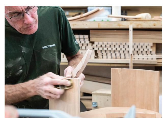
A carpenter works on furniture in the workshop of Benchmark, a company in England that will take back furniture, refurbish, and re-sell or donate it to help create a circular economy. BENCHMARK WOODWORKING LTD.

People also throw away a lot of stuff. Each person in the US generates an average of 650 kg (1,400 pounds) of municipal solid waste each year, adding up to 2% of US greenhouse gas emissions in 2022 (US EPA 2024). Discarding material products in landfills generates substantial carbon pollution because the low-oxygen decomposition of buried material generates methane,