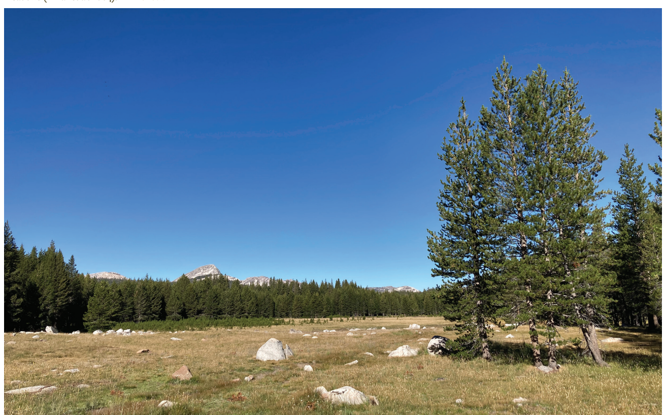
Tuolumne Meadows, Yosemite National Park, California, a site where anthropogenic climate change has caused a biome shift of subalpine forest into high-elevation meadows (Millar et al. 2004).

In West Africa, increasing rainfall from northern latitudes to the Equator differentiates vegetation into five biomes: the Sahara Desert; the Sahel, a savanna with singly spaced trees with bi-pinnately compound leaves; the Sudan, a dry woodland in which trees gather into groves and have pinnately compound leaves and dry fruits; Guinea, a closed-canopy tropical deciduous forest with trees that bear moist fruits; and the Congo, a moist evergreen tropical rainforest. My field research across six countries in West Africa revealed that climate change shifted the Sahel, Sudan,