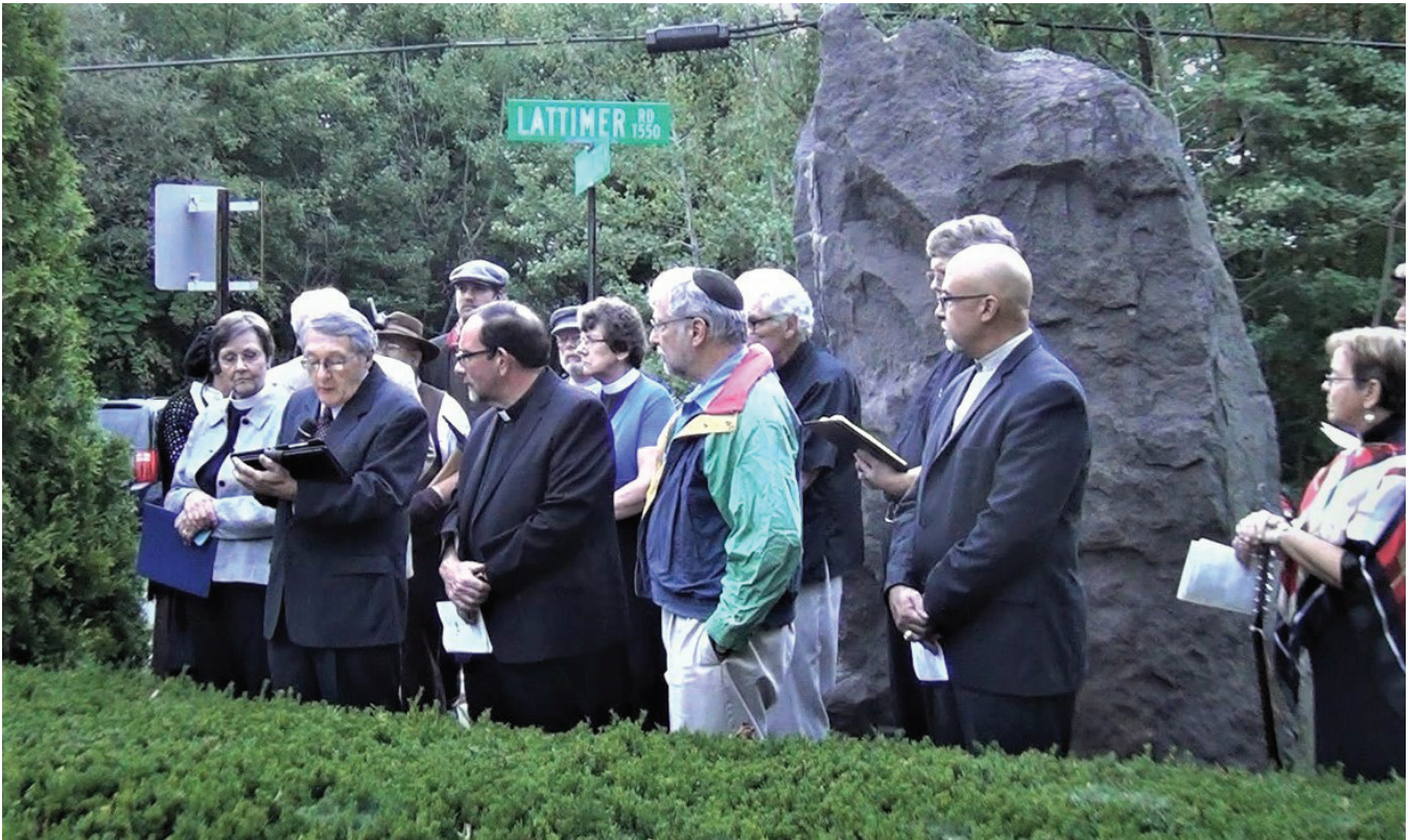
FIGURE 7 (top). The site of the massacre, shown here, sits across the road from the Lattimer memorial. Occasionally, the township street sweeper dumps refuse on the site. PAUL SHACKEL FIGURE 8 (bottom). Interfaith memorial service. While a Catholic Mass once was held on the anniversary of the massacre, beginning in 2011, an interfaith memorial service was conducted at the site. PAUL SHACKEL