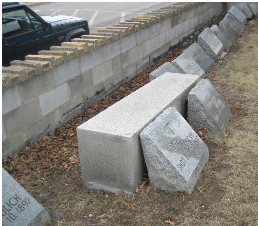
FIGURE 6. St. Stanislaus Cemetery Memorial as it is today. After the reconstruction of the cemetery wall, the Stanislaus memorial commemorating 14 of the miners killed at Lattimer has been placed inside the wall. Therefore, it can no longer be easily seen or read.

Recently, an interdenominational service has resurrected memorialization on the anniversary of the massacre (Figure 8). Except for two years during COVID, the services have been held annually, although the crowds seem to be diminishing. I was the keynote speaker at the 2019 annual Service of Healing and Remembrance, which gave me an opportunity to reflect on the lessons learned from Lattimer—about how new working-class immigrants are treated. The men who marched on Lattimer were part of an eternal, racial drama endured by most immigrants, which continues today. The social injustices and anti-immigrant sentiment evident in the United States over a hundred years ago still exist. That legacy is reasserting itself today, in chanting crowds and demagogic politicians whose idea of “real Americans” looks painfully close to that of the anti-immigrant activists of a century ago.