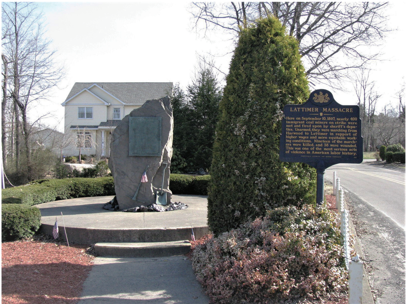
FIGURE 2. Lattimer Memorial. The memorial is a ten-foot shale boulder surrounded by a carefully manicured setting. It sits across the road from the massacre site. PAUL SHACKEL

The UMWA (United Mine Workers of America), established in 1890, faced a difficult situation in 1897. The organization supported Pennsylvania's Campbell Act, which taxed the coal operators 3 cents a day for each non-US citizen