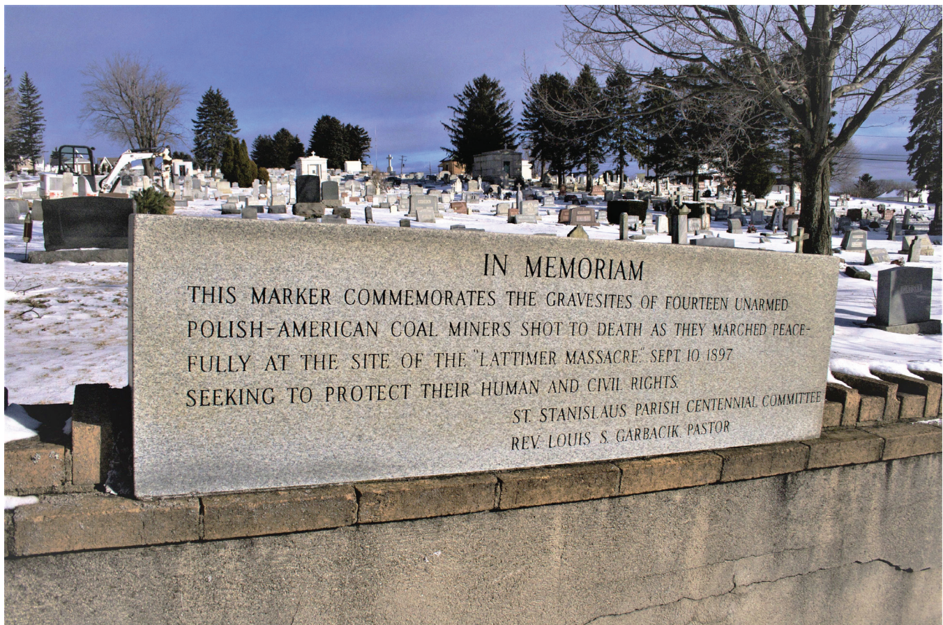
FIGURE 5. St. Stanislaus Cemetery Memorial. When erected in 1997, as shown here, the memorial faced the street and was above the graves of 14 of the Lattimer martyrs buried in the cemetery. PAUL SHACKEL

Labor histories have often been omitted from the national consciousness. The story of organized labor's struggle is often missing from the school curriculum. With the weakening of the labor movement in the 21st century, I fear that people have forgotten the many hard-fought battles for justice in pay and working conditions. For instance, Howard Zinn (2003: 54) questions why the Colorado Coal Mine Wars, which cast a dark shadow on American corporate