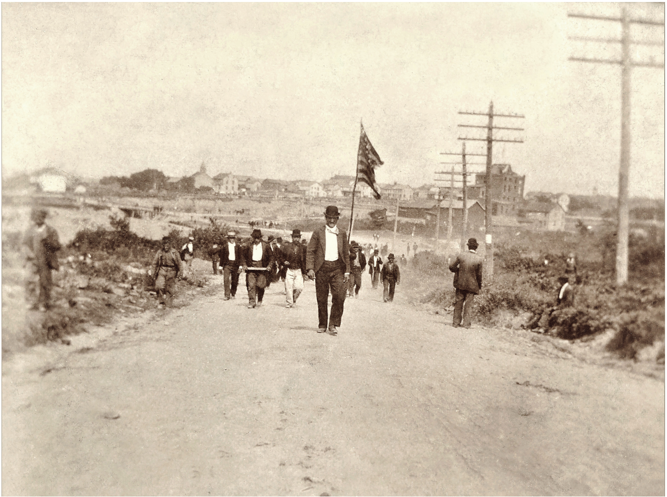
FIGURE 3. Lattimer Strikers. On September 10, 1897, striking mineworkers marched from Harwood, around Hazleton, to Lattimer. This is the only known image of the event.

began, “Five men fell dead around me. I flung myself flat on the ground and stayed there for about ten minutes.... As I lay on the ground, I lifted my head, and I could see that the deputies were firing at my fleeing companions, already about 300 yards away.” Some deputies broke rank and followed the workers for about 30 yards. The local newspaper reported, “The deputies taking cool deliberate aim, bringing down their men as if some choice fowl....” ( Daily Standard September 11, 1897).