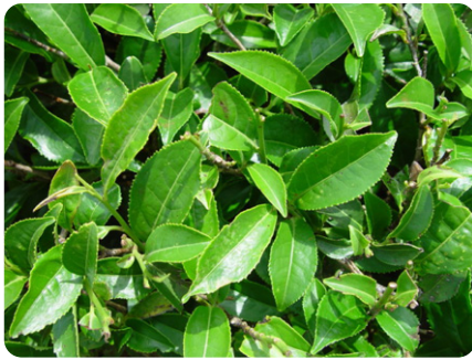
FIGURE 1 Green tea leaves

Meltzer. Green tea catechins for treatment of external genital warts. Am J Obstet Gynecol 2009.