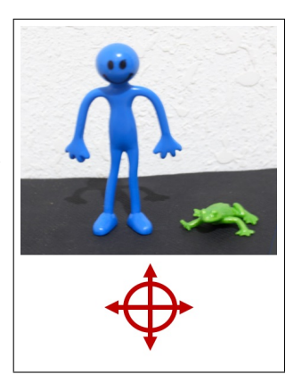
Figure 3: Relative frame of reference