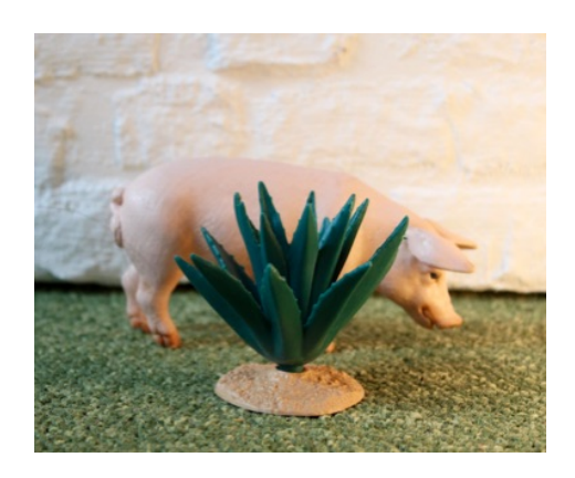
Figure 12: Pig behind the agave