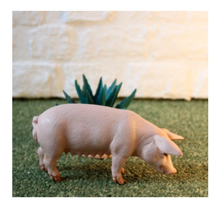
Figure 11: Pig in front of the agave