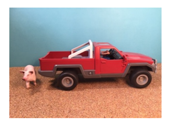
Figure 9: Pig at the back of the car