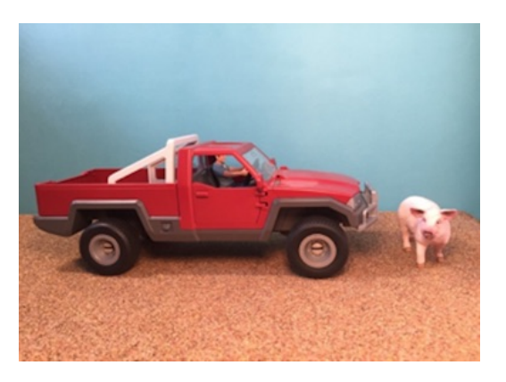
Figure 10: Pig at the front of the car