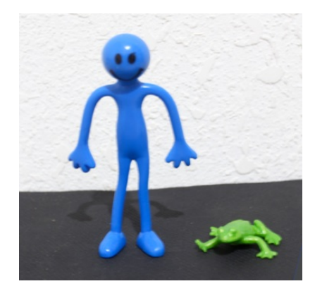
Figure 7: Frog to the man's left

All three languages make use of the intrinsic frame of reference whenever possible, provided the object (Ground) that a Figure relates to does have intrinsic parts. The human body not only has intrinsic body parts but also an intrinsic left and right side. For the speakers of Kaqchikel, Tz'utujil and Q'anjob'al the location of the frog is to the boy's left or right. Even though all three languages have terms for left and right, these are often not favored and other suitable terms like 'to the side' are chosen. In Kaqchikel rijqiq'a' the term 'right' is probably related to q'ij 'sun'.