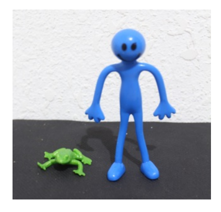
Figure 8: Frog to the man's right