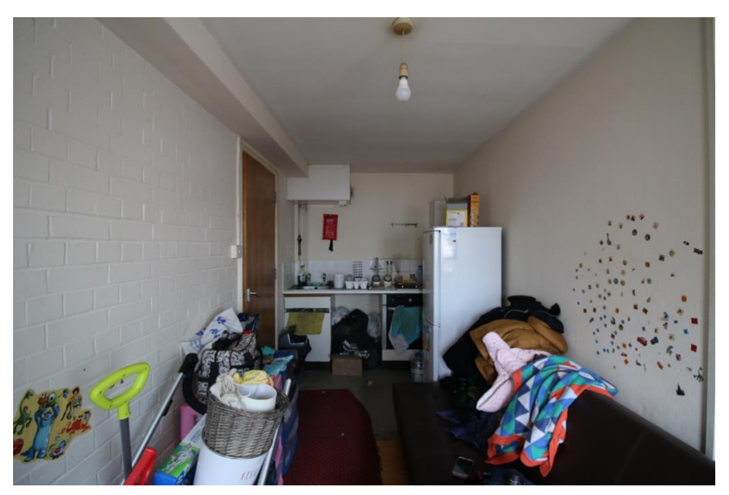
Figure 7. A Brimstone living room and kitchen for a family of four (Carolina Talavera)

23). This can be understood as both a recognition of the tensions that emerge from research that are aligned with social movements as well as the contradictions that emerge out of social struggle. Rather than diminish the insights which this research generated, I attempted to understand how these contradictions provided unique insights.