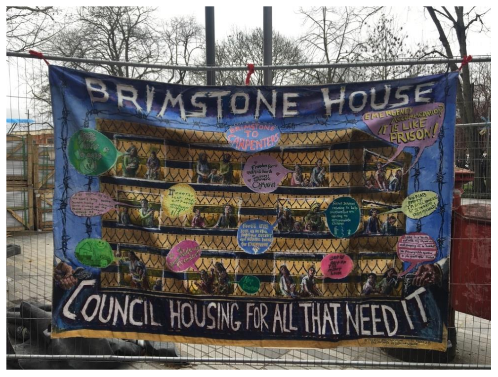
Figure 5. A Focus E15 Banner created by artist Andrew Cooper displayed at the weekly stall that reads "Brimstone House: COUNCIL HOUSING FOR ALL THAT NEED IT" (Carolina Talavera)

shortage.<sup>41</sup> Faced with being moved away from their social networks, the young mothers organized a petition to challenge their forced displacement. While collecting signatures, they encountered organizers from the Revolutionary Communist Group (RCG) campaigning against the recently implemented Bedroom Tax. This encounter led to an unexpected alliance between the RCG organizers and the young working-class mothers. After a year of struggle and persistent demands for Council housing, including a widely publicized occupation of a nearby decanted