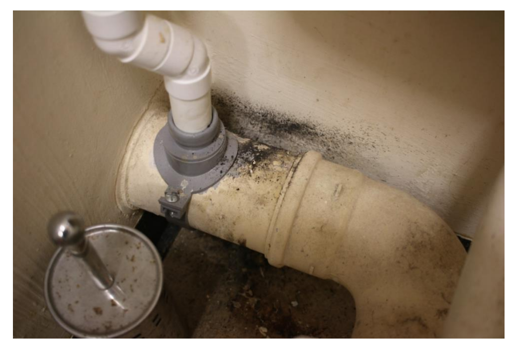
Figure 8. Mold behind the toilet and on the pipes (Carolina Talavera)

permanent Council housing or a private sector tenancy). Unhappy with the space (exposed concrete, no stove) and location, they were told to either take out a loan to cover the costs of furnishing it or risk being evicted from Brimstone. If they accepted, they would be able to challenge the Council's decision after moving in, but moving would nevertheless force them to accrue debt to temporarily make the space habitable. At their emotional limits with two small children in a single-bedroom flat in Brimstone, waiting was no longer an option. Caught between making themselves "intentionally homeless", losing the offered property, and continuing to live in an impossible condition, they accepted the offer rather than wait it out and engage in a public challenge of the situation. In a message sent to me via WhatsApp, Nura, the BH resident, wrote: "Feeling really crap dno if we did the right thing.. its just too much to think about if we didnt take the place.. after leaving at where we are for 2 n half years we are just fed up and just wna move out.."