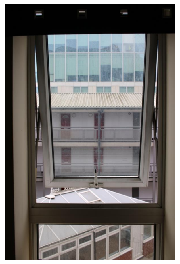
Figure 12. View from a Brimstone flat