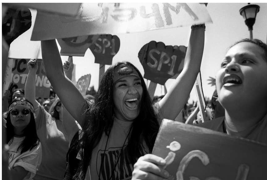
FIGURE 6. A Riverside student celebrates the Regents' decision to rescind SP-1. Los Angeles Times , May 17, 2001, p. B-1.

confirming a fall 2002 implementation date for comprehensive review—but only if the Academic Senate recommended it and the Regents approved it. 5