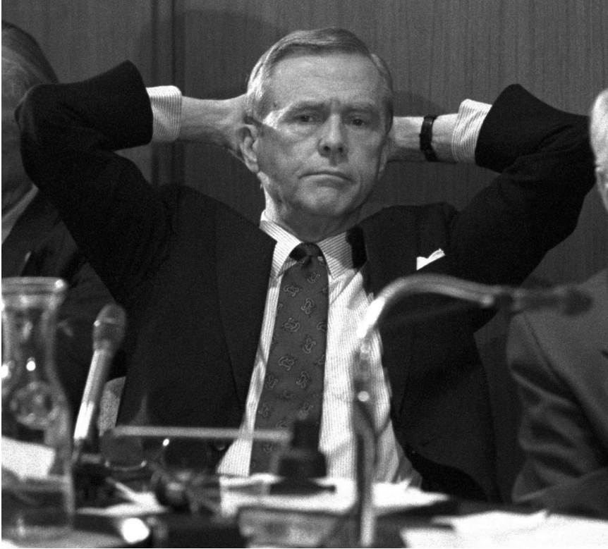
FIGURE 1. Governor Wilson listens as the Reverend Jesse Jackson speaks on affirmative action at the July 1995 Regents' meeting. Los Angeles Times, July 21, 1995, p. 1.

approved SP-1 by a margin of 14 to 10, with one abstention. Jackson and a group of protesters in the overflowing meeting room marked the moment by singing the anthem of the civil rights movement, "We Shall Overcome." The Regents decamped to another conference room to enact SP-2, 15 to 10. 13