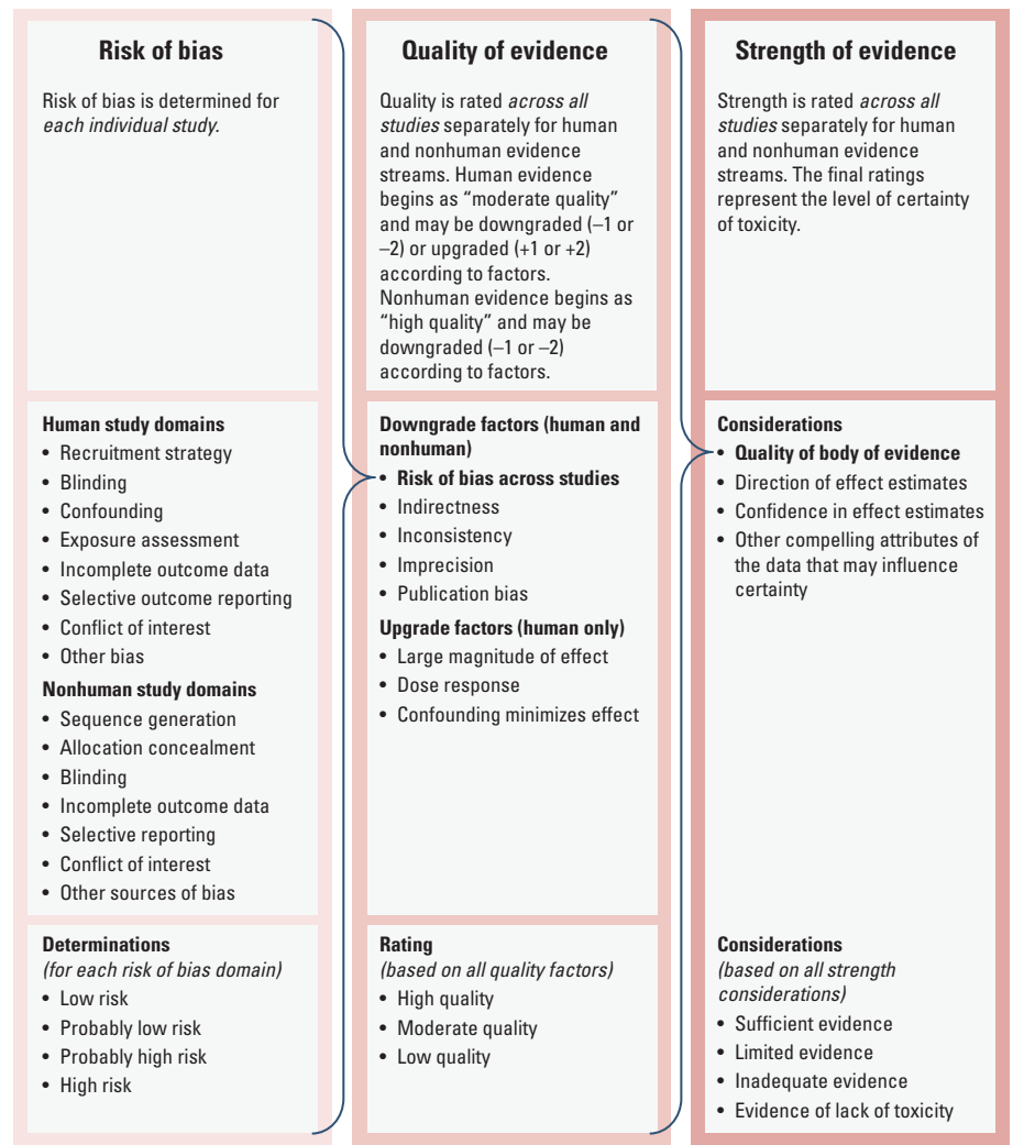
Figure 1. Overview of the Navigation Guide systematic review process to rate the quality and strength of the evidence.

On the basis of the recommendations mentioned above, we also included study funding source and declared financial conflicts of interest as a potential source of bias (i.e., whether the study received support from a company, study author, or other entity having a financial interest in the outcome of the study). We refer to this risk of bias domain generally as “conflicts of interest,” although for this particular case study we assessed only competing financial interests within this domain. A complete list of the human and nonhuman risk of bias domains is presented in Figure 1; detailed descriptions of each