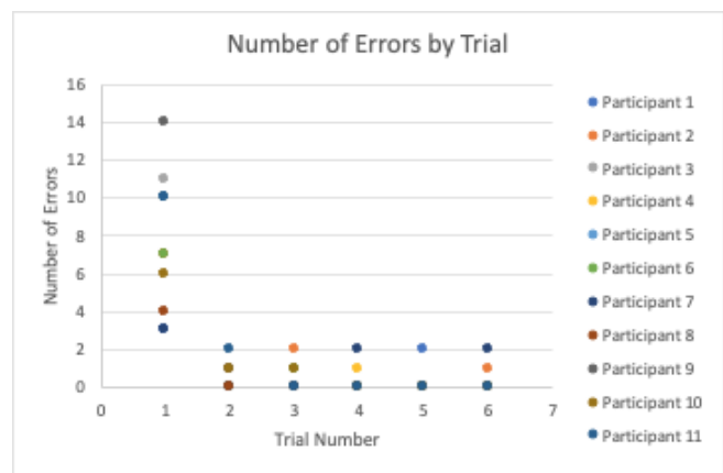
Figure 3. Number of errors per trial per participant pair

Turn-taking. As the participant pairs progressed through the trials, the number of conversational turns decreased ( F(1.09, 10.86) = 25.28, , p < .001, \eta^2 = .62 ). There was support for both linear and quadratic trends ( F(1,10) = 28.58, p < .001 and F(1,10) = 23.60 p < .01 respectively). Figure 4 illustrates the substantial decline from trial 1 to trial 2.