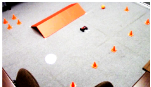
Figure 1: Remote control car in the experimental set up

The six chosen maneuvers are divided into categories based on verb type. Below is the list of each maneuver with their description and predetermined error criteria. These six maneuvers were chosen out of 16 pilot tested maneuvers to limit participant fatigue. Though categorized by path, manner, or combination for design purposes, these categories were not identified for the participants.