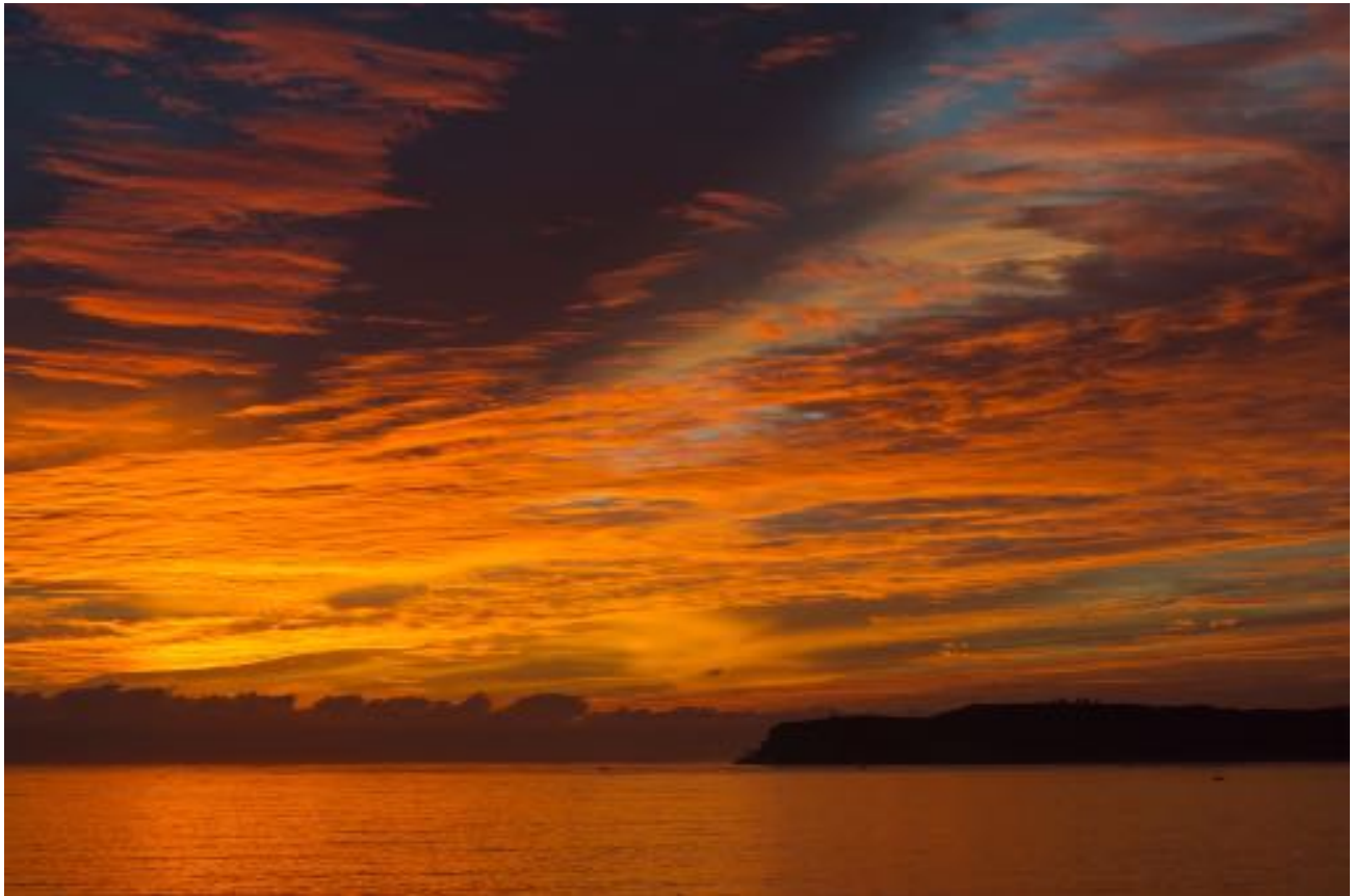
Christmas 2012 Sunset