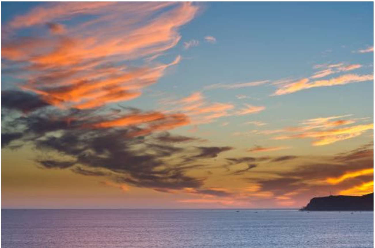
Sunset Over Point Loma