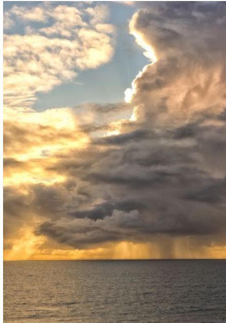
Sunset Squall © Mike Nothum