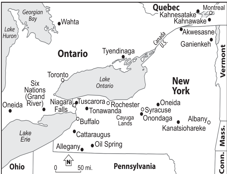
FIGURE 4: Eastern Iroquoia today. In the last three decades, Cayugas in New York have purchased or have been bequeathed approximately 1,000 acres in Seneca and Cayuga counties—lands that before dispossession, 1789–1841, had been part of their homeland. Map by Joe Stoll; used by permission.

Although the arbitrational tribunal effort and the one promoted by Deskaheh largely failed in securing formal international recognition, the Six Nations have continued the long quest across the globe to seek acknowledgment of its separate nationhood. Hodinöhsö:ni’ make and have made their presence known, whether by appeals to the United Nations in New York or in Geneva, Switzerland; attempts to use their own Six Nations-issued passports overseas; sending representatives to conferences related to global matters of concern such as climate change; or through its