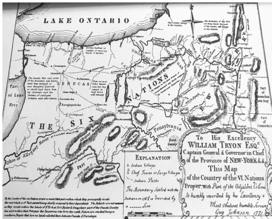
FIGURE 2: Guy Johnson Map presented to William Tryon, Royal Governor of New York Colony.

side of Cayuga Lake; Colonel Henry Dearborn's force destroyed the villages on its west side. As a result, Cayugas fled to the Niagara frontier, many taking refuge at British Fort Niagara. 12