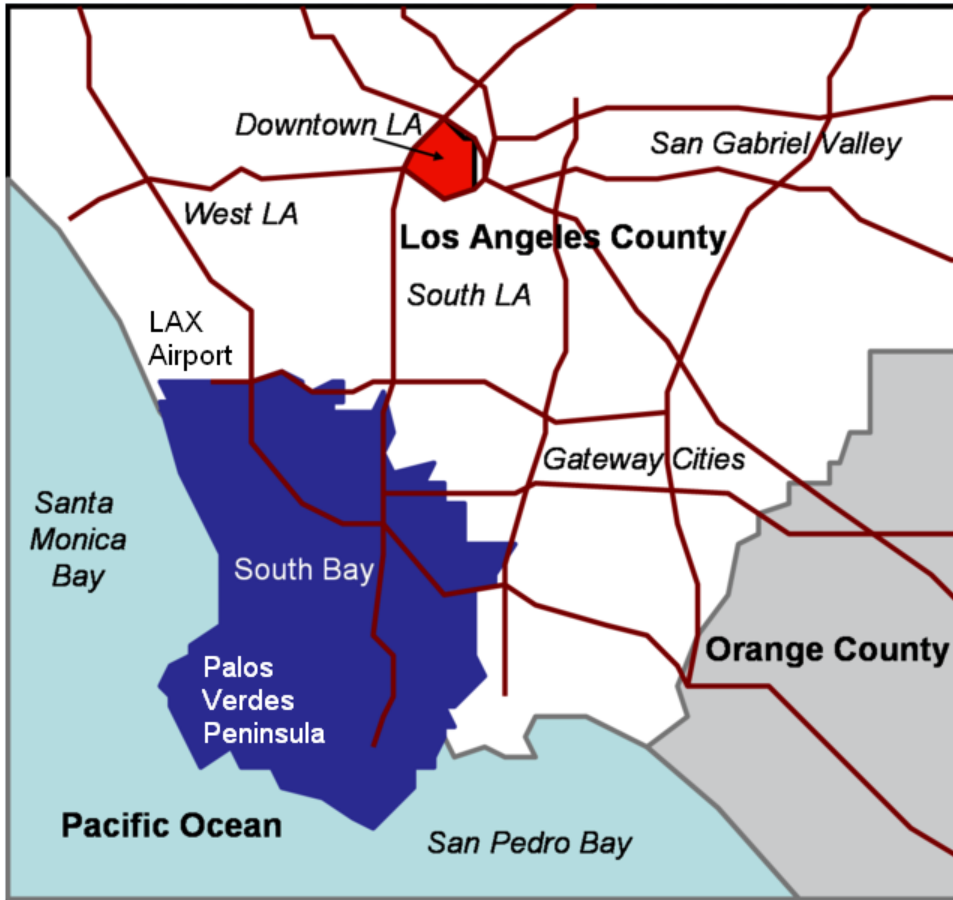
Figure 2.1. South Bay Orientation Map

The South Bay Area is also diverse in terms of land use and development patterns. It is a complex mosaic of neighborhoods which date from the prewar period to the postwar era. Large swaths of the coast are devoted to upscale single-family homes, especially towards the Palos Verdes Peninsula, while large tracts of land further inland are devoted to commercial and industrial use. Wide arterials such as Pacific Coast Highway and Hawthorne Boulevard crisscross the region, contributing to the South Bay's auto-centric orientation. Unlike some parts of Los Angeles County, the South Bay Area remains relatively underserved by transit, especially towards the south and west away from downtown Los Angeles. In response to these trends, and also due to the fact that