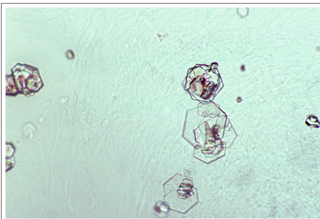
Figure 2. Characteristic hexagonal cystine crystals in urine microscopy.

Stone analysis is the gold standard for determining the type of kidney stone in any patient and similarly can be diagnostic in cystinuria. 2,4,12 Microscopic examination of the first morning urine sample can reveal pathognomonic hexagonal crystals (Figure 2), which is highly specific for cystinuria and can be seen in up to 2/3 of untreated patients. 24,25 For determining cystine hyperexcretion, the sodium-nitroprusside test can be used as the initial screening test. In this qualitative colorimetric test, urine displays a purple color in the presence of high cystine concentration. Although useful as a screening test, it can yield false-positive results in homocystinuria, renal Fanconi syndrome, and patients taking ampicillin or sulfa-containing drugs. 10,25 Thus, positive results need confirmation by quantitative chromatographic analysis of urine for cystine excretion. Measurement of 24-hour urine cystine excretion is the gold standard test for determining cystine hyperexcretion. In healthy subjects, daily urine cystine excretion is <30 mg,