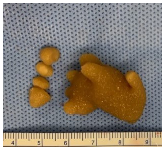
Figure 1. Staghorn calculi in a pediatric cystinuria patient (image courtesy of Dr. Aaron J. Krill, Children's National Hospital, Washington, D.C. We also thank the patient and family for sharing the photo with us and permitting to use).

Stone analysis is the gold standard for determining the type of kidney stone in any patient and similarly can be diagnostic in cystinuria. 2,4,12 Microscopic examination of the first morning urine sample can reveal pathognomonic hexagonal crystals (Figure 2), which is highly specific for cystinuria and can be seen in up to 2/3 of untreated patients. 24,25 For determining cystine hyperexcretion, the sodium-nitroprusside test can be used as the initial screening test. In this qualitative colorimetric test, urine displays a purple color in the presence of high cystine concentration. Although useful as a screening test, it can yield false-positive results in homocystinuria, renal Fanconi syndrome, and patients taking ampicillin or sulfa-containing drugs. 10,25 Thus, positive results need confirmation by quantitative chromatographic analysis of urine for cystine excretion. Measurement of 24-hour urine cystine excretion is the gold standard test for determining cystine hyperexcretion. In healthy subjects, daily urine cystine excretion is <30 mg,