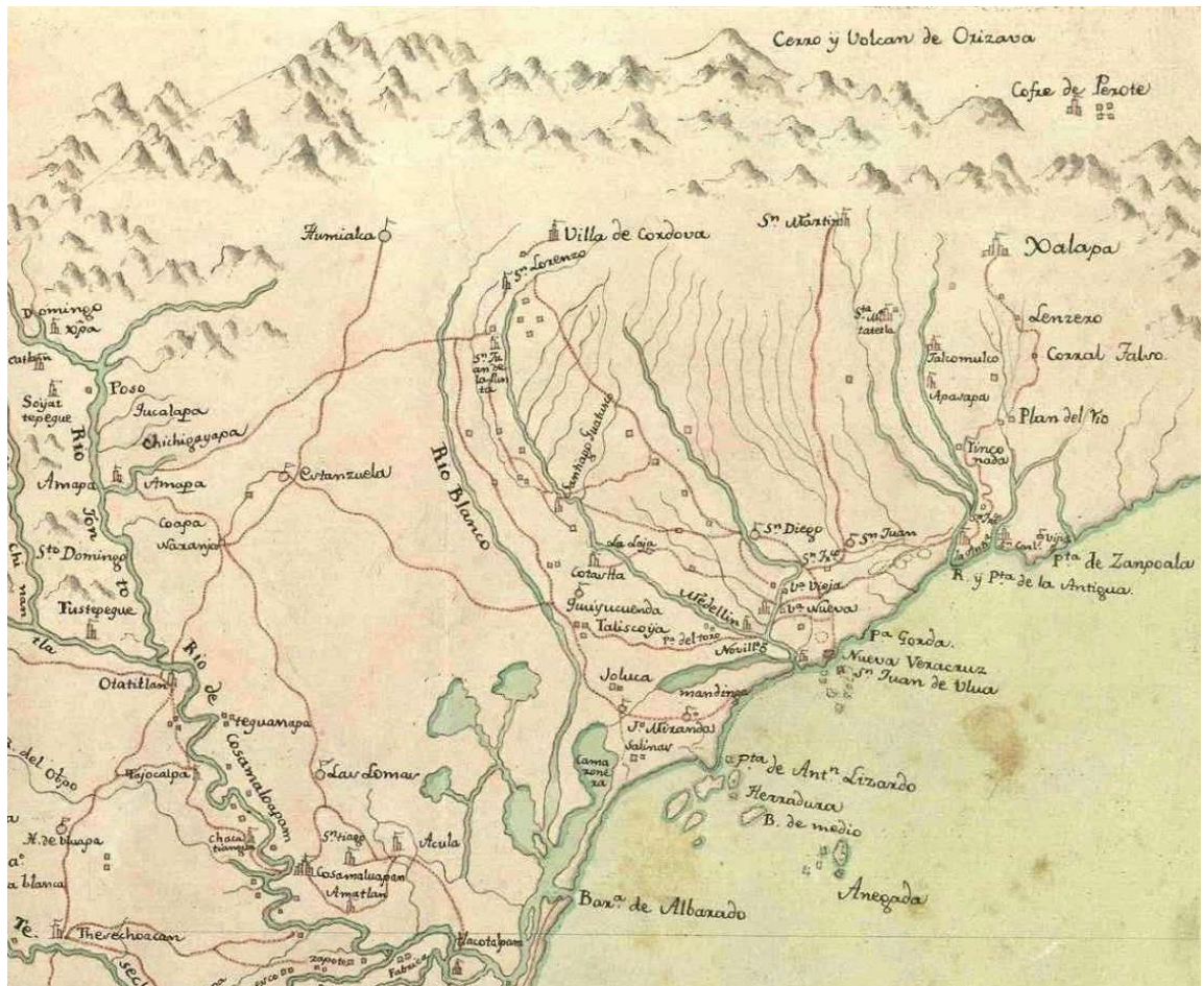
Map 2. Representation of the Cuenca Cimarrona . Extracted from Miguel del Corral and Joaquín de Aranda, Porción de la Costa del Seno Mexicano desde la Puntilla de Piedra al Sureste hasta la Barra de Coatzacoalcos; Istmo de Tehuantepec hasta el mar del sur , 1793. Manuscript. Mexico. Archivo Genral de la Nación.