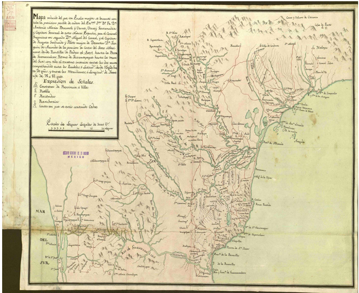
Map 1. Miguel del Corral and Joaquín de Aranda, Porción de la Costa del Seno Mexicano desde la Puntilla de Piedra al Sureste hasta la Barra de Coatzacoalcos; Istmo de Tehuantepec hasta el mar del sur , 1793. Manuscript. Mexico. Archivo General de la Nación.