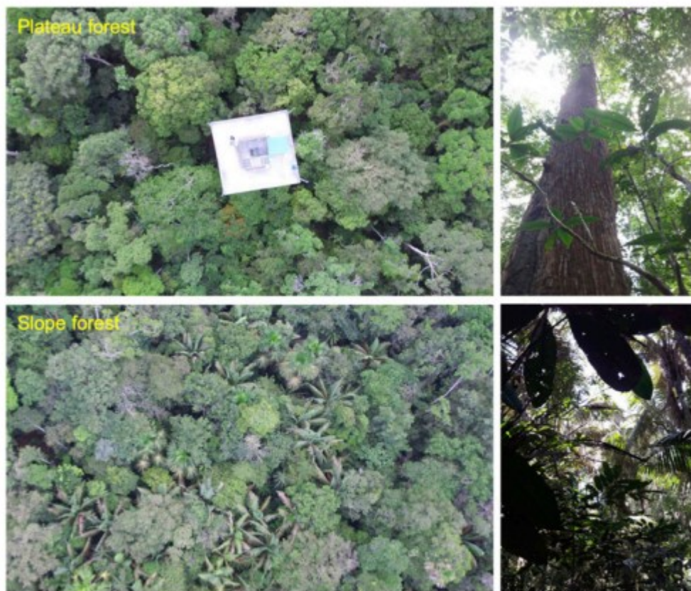
Fig. 2. Photographs of the trees of the plateau forest (location A; Top ) and the slope forest (location B; Bottom ) of Fig. 1. ( Left ) The downward images of the top of the forest canopy were taken by a camera on the UAV. ( Right ) The upward images from the ground through the canopy were taken by a hiker at those locations.

Mimosaceae (specialized legumes), Rapataceae, Solanaceae (nightshades), and Sapotaceae. The species that grow in abundance are distinct for each forest subtype. The photographs shown in Fig. 2 of the slope and plateau forests at locations A and B highlight differences in forest composition at the 2 locations.