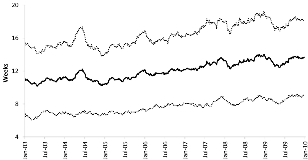
Figure 2. Weeks from diagnosis to chemotherapy by date of presentation to the National Comprehensive Cancer Network center. The solid black line refers to the 90-day simple moving average (SMA). Dashed lines refer to the SMA +/- 1 SD.