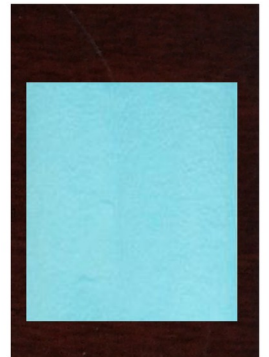
Paso 1. Coloque el campo celeste sobre la mesa.