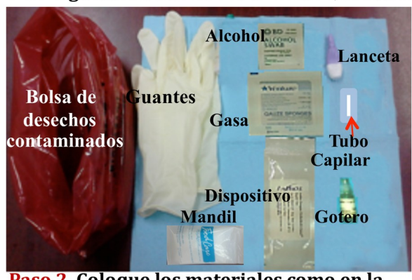
Paso 2. Coloque los materiales como en la foto y reconozca cada uno. Use la bolsa roja para todo lo que vaya botando.