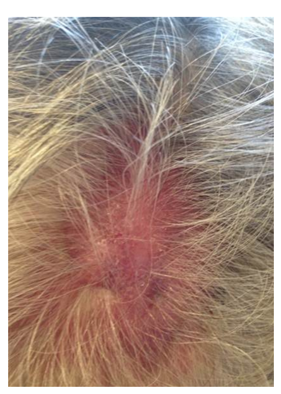
Figure 1. Violaceous, firm, irregular plaque across the scalp.

A 59-year-old woman with Philadelphia chromosome positive (Ph+) B-cell ALL was initially treated with combination chemotherapy and dasatinib. Thereafter, she underwent umbilical cord stem cell transplantation in her first complete remission. Low dose (20 mg daily) dasatinib maintenance was started after white blood cell count recovery. On day 236 post transplantation she presented with a 6 x 4 cm violaceous, firm, irregular plaque on her scalp (Figure 1).