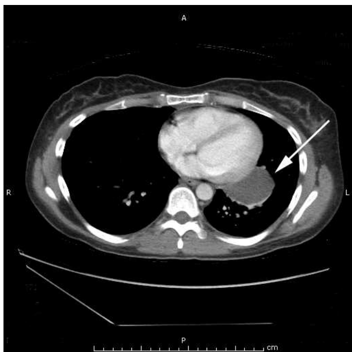
Figure 2. Chest computed tomographic scan with intravenous contrast obtained 17 months previously and showing (arrow) a 4.5 × 2.8-cm, well-defined, encapsulated fluid collection contiguous with the left heart border.