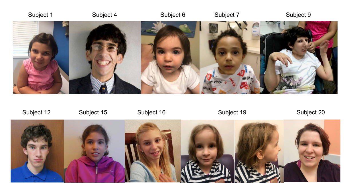
Figure 2. Facial Characteristics of Individuals Harboring MORC2 Variants

MORC2 is involved in epigenetic silencing and expressed in neural tissues predominantly at early stages of development, 2,19 providing a potential substrate for neurodevelopmental disability. MORC2 has also been shown to bind ATP citrate lyase, the enzyme that catalyzes the formation of cytosolic acetyl-CoA, a critical building block for multiple biosynthetic pathways, 20 providing a potential mechanism for the presence of mitochondrial features in these individuals. Consistent with previous reports, all variants identified in our cohort cluster in the gyrase, Hsp90, histidine kinase, MutL (GHKL)-type ATP binding domain and the transducer-like domain, which together form the ATPase module of MORC2. Similar to other GHKL-type ATPases, ATP binding and hydrolysis by MORC2 functions as a conformational switch. 15,21 Upon ATP binding, the ATPase module dimerizes and becomes active, allowing for HUSH complex activity leading to transcriptional repression. 15 Assessing the functional effects of different MORC2 variants, Douse et al. showed that, in the setting of normal ATP-dependent dimerization, neuropathic mutations resulting in weaker ATPase activity hyperactivated HUSH-mediated silencing. 15 All six of the MORC2 variants that we tested hyperactivated silencing by the HUSH complex in cellular assays, and thus, it is likely that these variants also exert their pathogenic effects by diminishing the ATPase activity of MORC2.