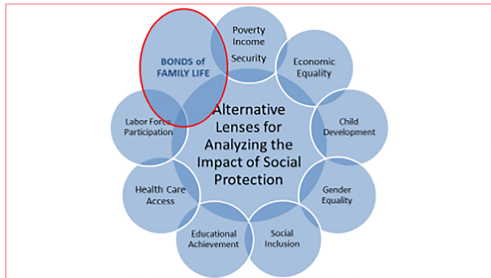
Fig. 3 Alternative perspective for analysis of social policy