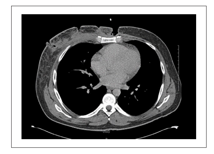
Figure 3. Computed tomography scan of chest with contrast, axial view, revealing decompressed right chest wall abscesses after incision and drainage with several open wounds.

of California, Davis, and Kern County Public Health do not test for EIA in their panel. Overall, serologic testing can be limited and may be insensitive in early infection. Serial serological testing is recommended in cases with high clinical suspicion.<sup>6</sup> A complete blood count with differential for peripheral eosinophilia is seen in 25% to 30% of cases.<sup>6</sup> Radiographic evidence of the pulmonary involvement of the infection may vary from pulmonary infiltrates, pleural effusions, empyema, hydropneumothorax, adenopathy, pulmonary nodules, cavities, tree-in-bud changes, and multifocal ground-glass infiltrates, depending on the severity and the chronicity of the disease.<sup>5</sup>