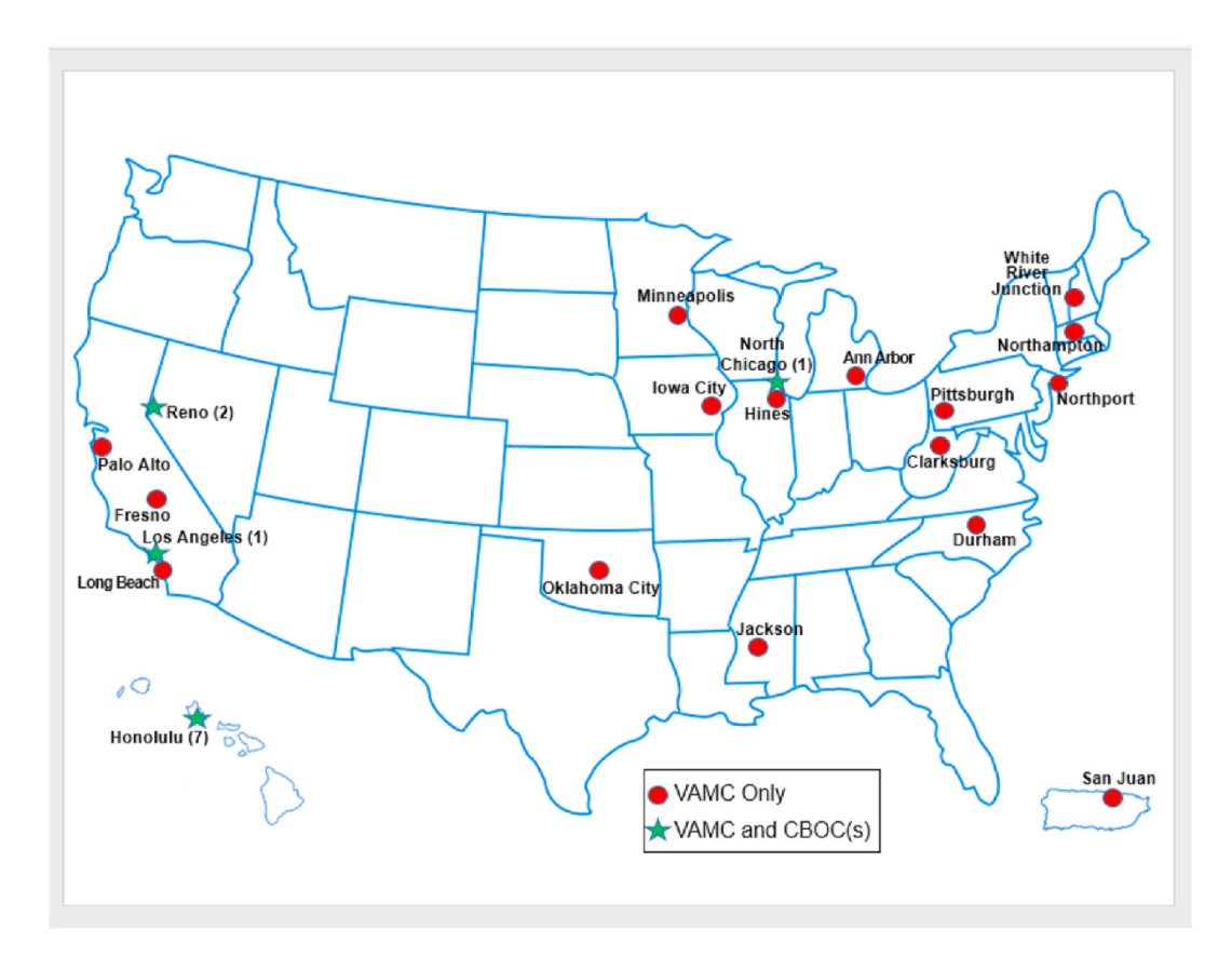
Fig. 2. CIH card study—map of participating sites.