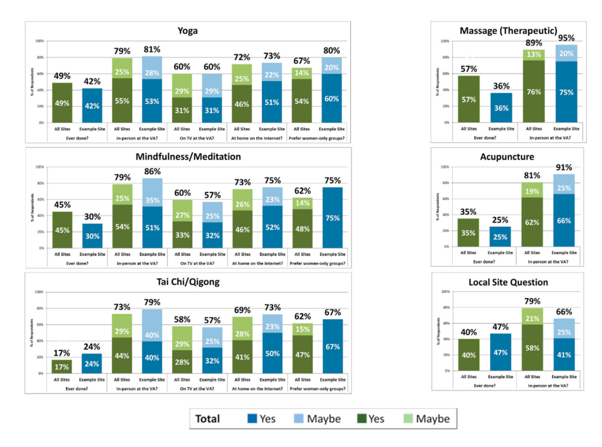
Fig. 3. CIH card study site-specific report example, women veterans' preferences.