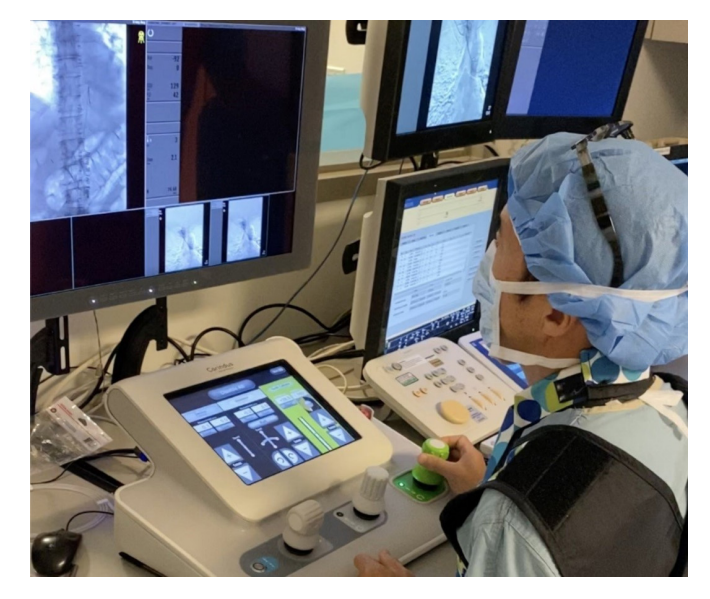
Figure 3 Catheter manipulation using a push–pull and rotation joystick control solely based on the visual information.

T9 segmental arteries, and the Artery of Adamkiewicz from the left L1 branch (figure 2). A total of 22 segmental arteries were selected. Once tumour stain was identified from bilateral T3, T4 and T5 segmental arteries, an Echelon 10 microcatheter (Medtronic, Irvine, California, USA) was manually catheterised into those feeders via the 5-French catheter followed by particle and coil embolisations. The total fluoroscopy time of the entire procedure was 59 min. The patient experienced no complications and was unchanged on the day following the procedure.