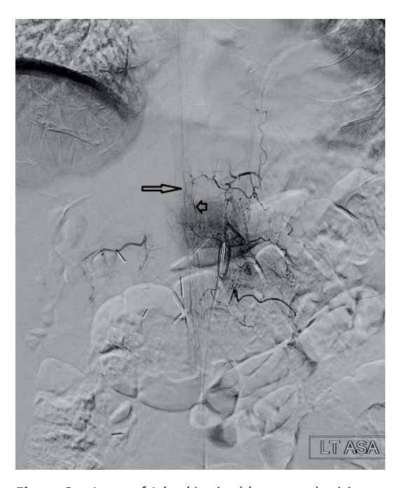
Figure 2 Artery of Adamkiewicz (short arrow) arising from the left L1 branch identified using robotic spinal angiography. The anterior spinal artery is identified with the long arrow.

descending aorta. The catheter was then connected to a rotating haemostatic valve and a micro guidewire (V-18 ControlWire, Boston Scientific, Marlborough, Massachusetts, USA) was inserted for the subsequent robotic manipulation. The catheter was continuously flushed with heparinised saline and another side port was connected to an extended connection tubing that allowed for contrast injections manually or using a contrast media injector. The robotic arm was then brought into position and the catheter-guidewire combination was loaded into the single-use cassette (figure 1).