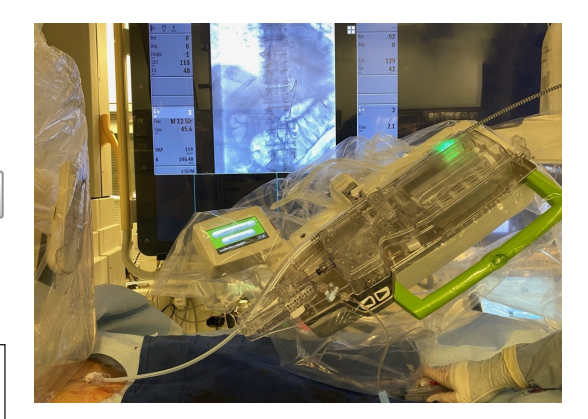
Figure 1 Robotic arm loaded with the catheterguidewire combination into the single-use cassette.

The spinal angiography procedure was performed under general anaesthesia using femoral artery approach. For the manual portion of the procedure, a 5-French groin sheath was inserted in the groin and a 5-French Mickelson catheter was advanced to the