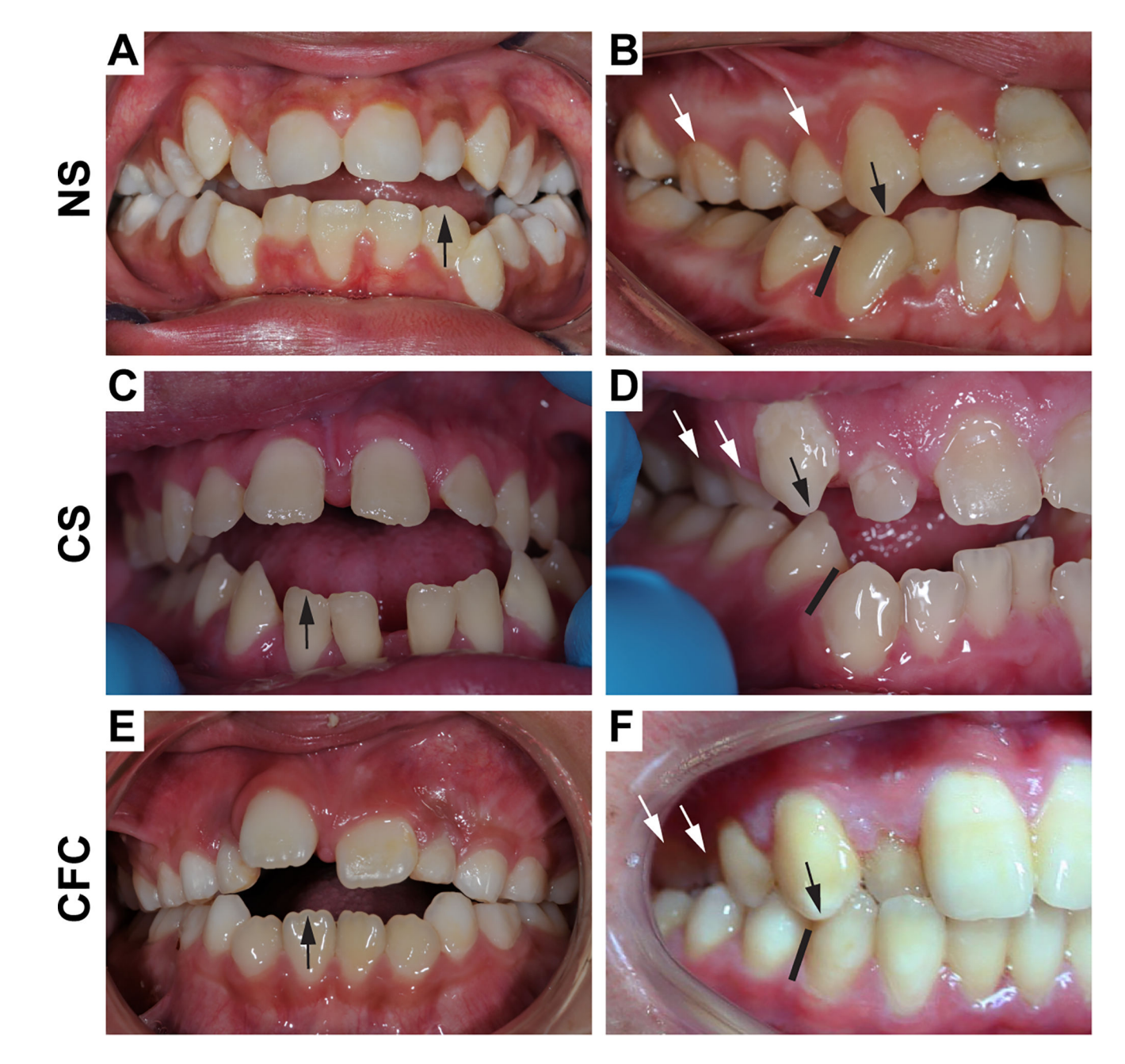
Figure 3. Dental characteristics of NS, CS, and CFC

(A, C, E) Open bite. Black arrows point to mamelons, which are normally abraded by contact. (B, D, F) Posterior crossbite (demarcated by white arrows). (B) Individuals with NS present with expected incidence of class I occlusion and class II malocclusion as shown by black arrow demarcating maxillary canine cusp tip anterior relative to the contact between the mandibular canine and first premolar (black line). (D) CS individuals have higher incidence of class III malocclusion with the maxillary canine (black arrow) posterior to the contact (black line) while (F) CFC individuals present with normal distribution of class I