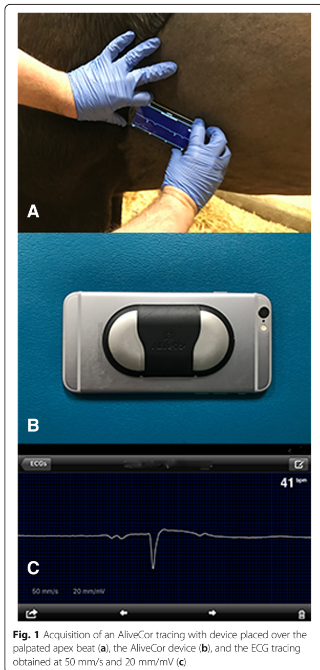
Fig. 1 Acquisition of an AliveCor tracing with device placed over the palpated apex beat (a), the AliveCor device (b), and the ECG tracing obtained at 50 mm/s and 20 mm/mV (c)

left ventricular fractional shortening (FS) in the following way: FS\% = (LVIDd - LVIDs) / LVIDd \times 100\% . The maximal left atrial diameter in systole was measured from the right (LADsax) left hemithorax (LADlax). Color Doppler examination of the mitral, tricuspid, and aortic valves were recorded and scored for presence and severity of regurgitation by the subjective color Doppler surface area method [20].