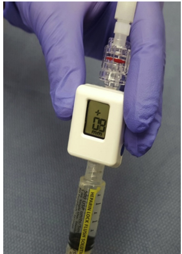
Figure 1. Compact manometer.

PPG values ranged from 1.5 to 19 mm Hg (mean, 8.2 mm Hg). Fifteen of 28 patients (57.1%) had evidence of PH based on PPG, of whom 10 of 15 (66.7%) had clinically significant portal hypertension (CSPH). Eleven of 28 study participants had endoscopic evidence of either esophageal or gastric varices, with all 11 (100%) having PH and 10 (90.9%) patients having CSPH based on EUS-PPG measurement.