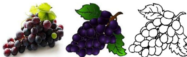
Figure 1: Example photograph (left) and line drawing (right) from Exp. 1-2 and color drawing (center) from Exp. 2.

Materials. Eighty picture pairs were used, with each pair consisting of one black-and-white line drawing of an object from the Snodgrass and Vanderwart (1980) set of normed pictures and one full-color photograph of the same object obtained from the Web, selected to closely match its