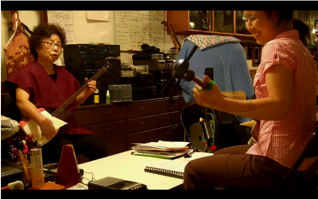
Figure 6 My shamisen lesson with Sensei.

Sensei got very technical today focusing on my bachi hand and correcting the way I strike. (Figure 6) She said that everything should be a triangle (the space between the thumb and index finger, the angle of the wrist to the shamisen body and the way the bachi is struck). I have a habit of striking downwards instead of towards the fingerboard, which inhibits me from producing a nice, resonant sound. Sensei kept correcting the way I strike, and after a while, I felt as though she was saying “NO! Chigau (wrong),” before I even struck. My pinkie kept drifting away from the bachi, so Sensei created a “pinkie holder” by applying masking tape to my bachi to create a little slot for my pinkie.