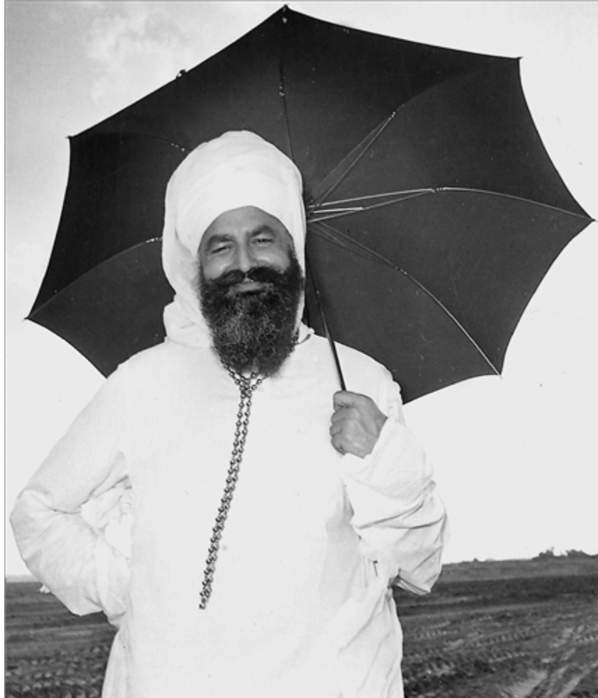
Figure 1: Maharaj Virsa Singh standing in the freshly ploughed fields at Gobind Sadan, outside of New Delhi, circa 1971.