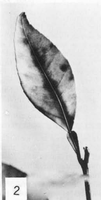
Fig. 2. Chlorotic leaf of sweet orange with green patches on narrow lamina.

ing. Some seeds in diseased fruits develop normally, but most are small and dark colored.