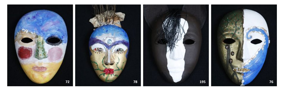
Fig. 2 Examples of Student Masks

I ate the pancakes like I was supposed to EVERY DAY. A pancake a day to keep the test takers away And I guess they never told me that I would get tired of pancakes While my grandma was sick with the flu I ate pancakes When my cousin celebrated his 8<sup>th</sup> birthday I ate pancakes When my mom called to ask why I didn't come home I ate pancakes As I consumed pancakes, they consumed me So this is an ad for pancakes I'm looking for someone who wants to try pancakes I've got loads to spare I've learned that eating pancakes alone is just too great a task If you have additional ingredients, a new idea On how to make pancakes great again Give it to me for my pancakes Med School is like a tack of pancakes