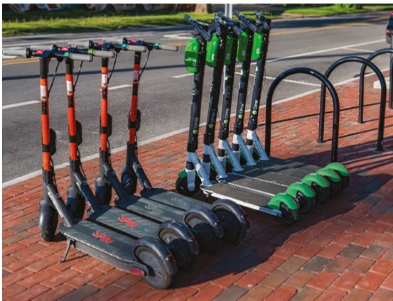
Standing Electric Scooter Sharing