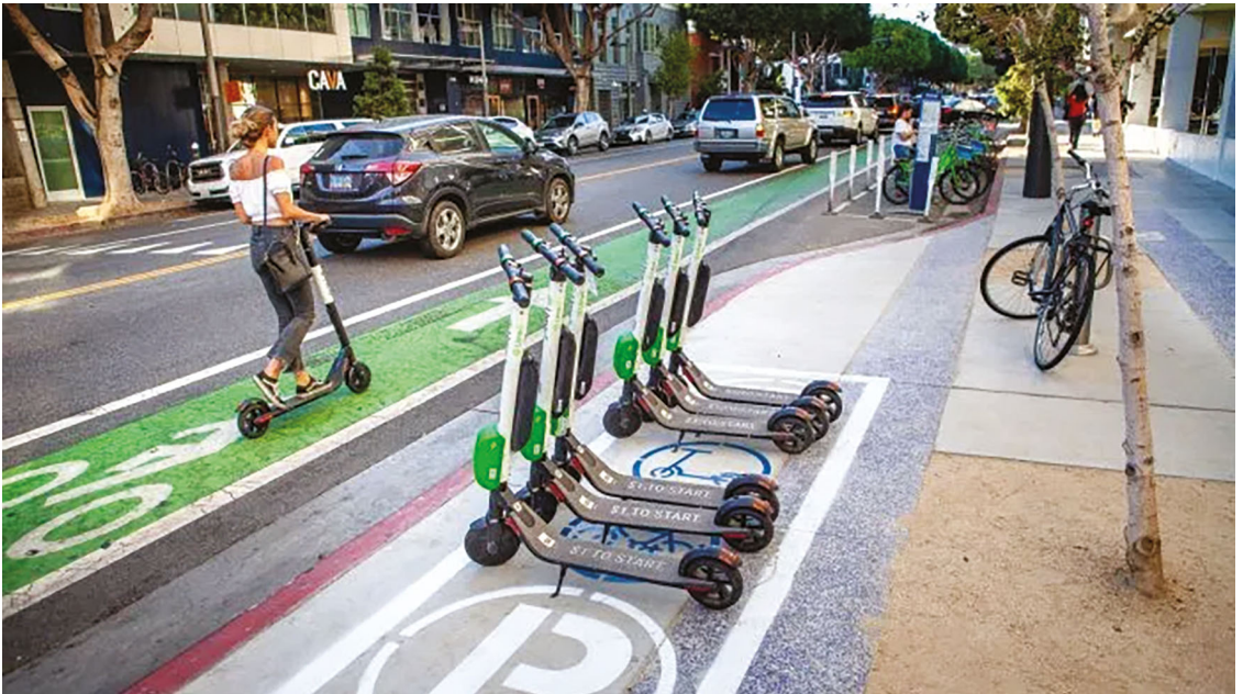
Figure 4. Santa Monica's micromobility corrals.

Both case studies exemplify the diverse ways that cities are responding to the challenges associated with the rapid growth in the number of micromobility devices. Developing curb space management policies for shared micromobility can be key to providing policy support for non-vehicular