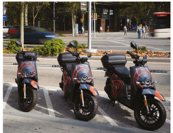
Moped-style Scooter Sharing

Figure 1. Common types of shared micromobility.