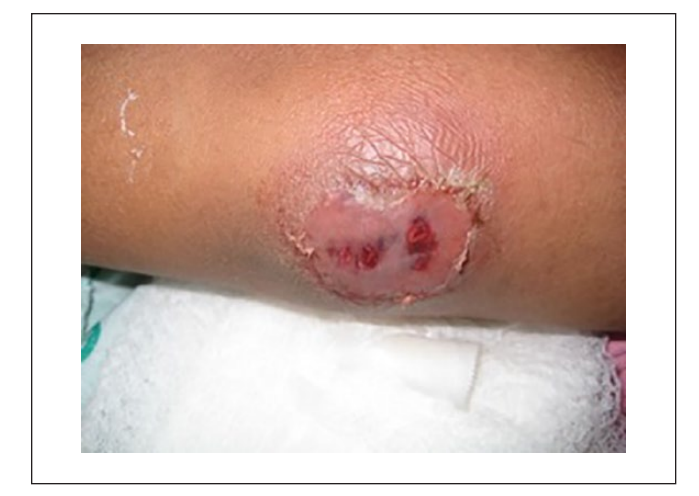
Figure 1. Right elbow on admission.