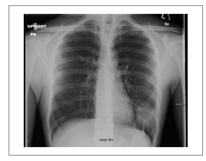
Figure 5. Chest X-ray on admission for case 1.