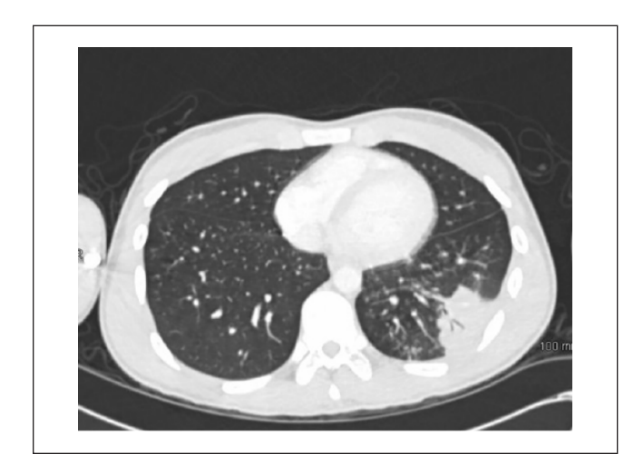
Figure 6. Chest computed tomography on admission for case 1.