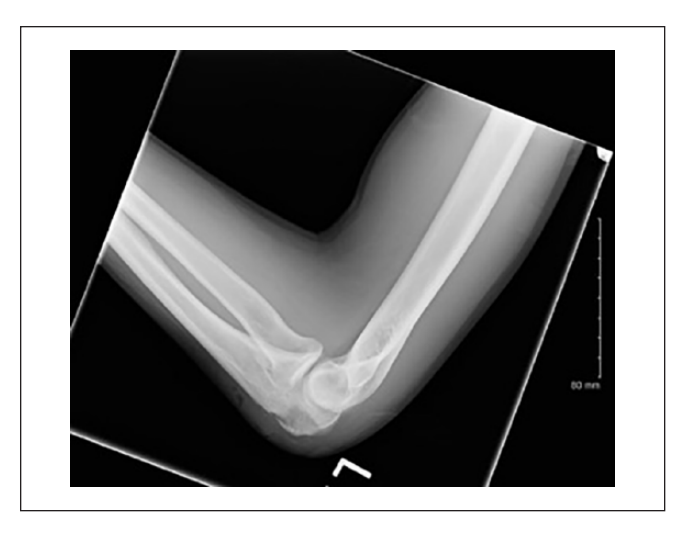
Figure 4. Left elbow X-ray on admission.

Subsequent persistence of swelling, erythema, and pain resulted in a visit to the Kern Medical Emergency Department 30 days after initial trauma. The patient was noted to have cough and subjective fever, as well as pretibial swelling and erythema with no break in the epidermis. Imaging demonstrated right lower lobe pneumonic infiltrate and a lytic lesion in the right tibia (Figures 7 and 8). Operative management included saucerization and debridement. Coccidioidal serology was negative for immunodiffusion IgM and positive for immunodiffusion IgG with a complement fixation titer of 1:32. Intraoperative cultures were positive for Coccidioides species. The patient was started on oral 800 mg fluconazole daily. The patient continues to follow-up in clinic with full resolution of the tibial wound and last complement fixation titer of 1:8.