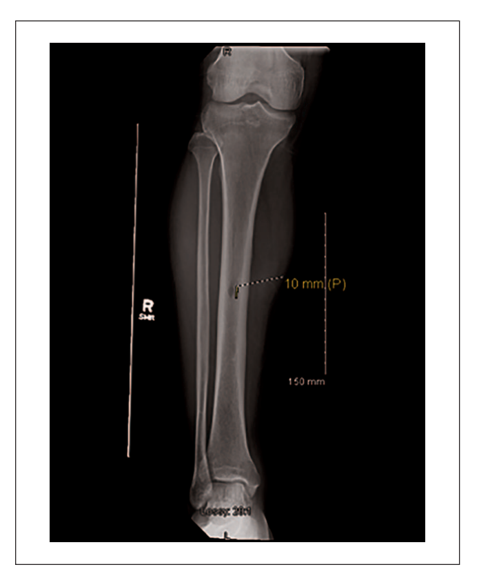
Figure 8. Tibial X-ray on admission for case 2.

study performed in San Joaquin Valley, California, demonstrated a 5:1 increase in disseminated disease in male compared with female patients, suggesting that a hormonal or genetic component may be involved. <sup>3,13</sup> The patient's ethnic background, more specifically those of Filipino and African