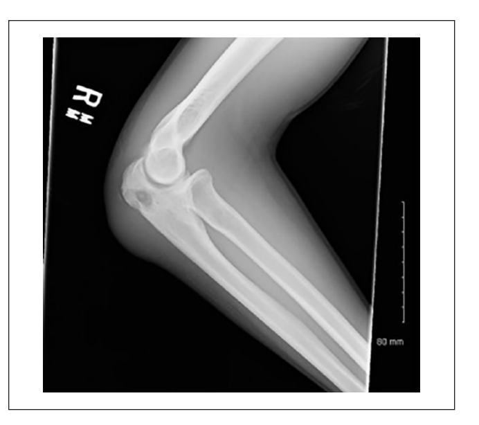
Figure 3. Right elbow X-ray on admission.

A 43-year-old previously healthy Hispanic male resident of Bakersfield with a subacute cough and no other described symptoms suffered a right anterior tibial injury secondary to a fall from a forklift. At an urgent care, there was no evidence of bony injury or a break in the integument; however, swelling, erythema, and pain were appreciated at the site of injury.