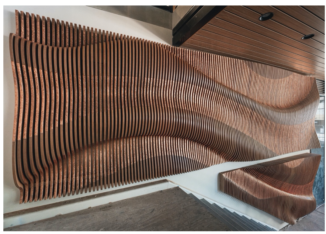
Figure 2. Kaili Chun, Muliwai , 2022. Plywood and copper installation, Waikīkī Market, Honolulu, Hawai'i.