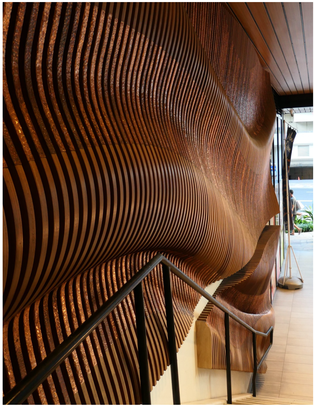
Figure 4. Kaili Chun, Muliwai (detail), 2022. Plywood and copper installation, Waikīkī Market, Honolulu, Hawai'i.