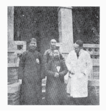
Figure 4 (Henke Collection)

cure. Picture below shows the boy who was unable to open mouth for 9 years. His story is in "Fruits of Labour".