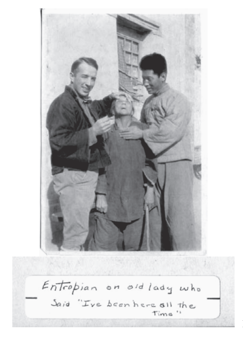
Figures 7a, 7b