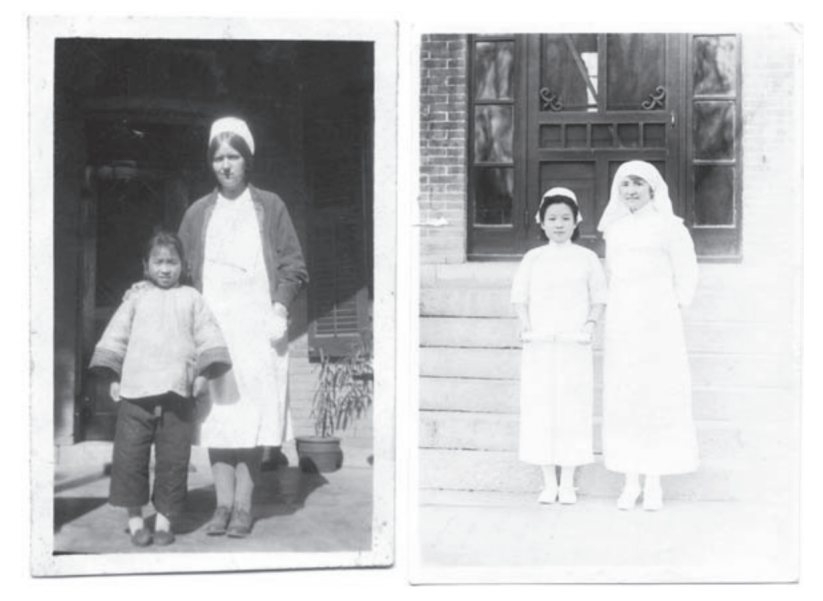
Figures 8a, 8b

They left China carrying with them the Cine-Kodak, their still camera, and the Kodachrome film of the Easter sunrise service. They left behind Ai Jung, their mission station at Shuntehfu, and their Chinese coworkers and patients. But the memories and the images remain.