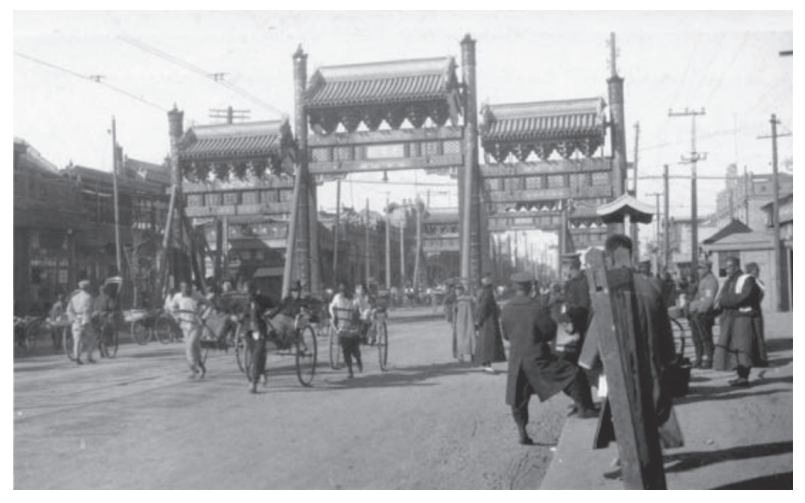
Figure 3 (Henke Collection)

Other photographs taken later in the Henkes' stay in Beijing show their increasing understanding of the environment ( Figure 3 ).<sup>25</sup> One such image, taken in 1928, shows a busy Beijing street framed by an ornamental gate, a pailou (牌樓).