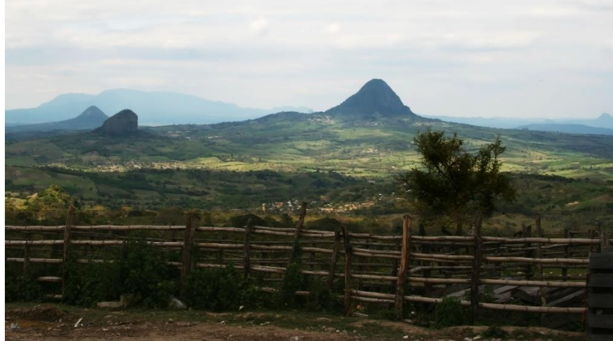
Figure 11. View from the foothills of Postectli Mountain towards the northeast. Ixcacuatitla, 2010.

Figure 11 shows the elevations that are believed to have detached from the Postectli depicted in the story. Different versions of this oral tradition are known around the neighboring towns. A similar association is present in another folktale, which narrates how the leafcutter ants used to climb up the Postectli, pick up soil, and bring it down to the people. Similarly in this story, God broke the mountain in fury so no one would ever trespass. Alan Sandstrom collected a similar story in a Nahuatl community located a few miles away on the southeast side of the Postectli, in which ants and other insects reached the sky by climbing up the Postectli (Sandstrom 1991: 241-242). For the Nahuas in the community of Amatlan (a pseudonym assigned by Sandstrom), the Postectli is identified as the Governor and represents an important center of devotion. During 2011, the ritual specialist who actively collaborated with Sandstrom visited the Postectli and celebrated a chicomexochitl ceremony. This ritual specialist's work is considered very successful and he is recognized in Ixcacuatitla as a knowledgeable and powerful celebrant. The Chicomexochitl at this time was an offering the ritual specialist gave as a promise, asking the mountain to