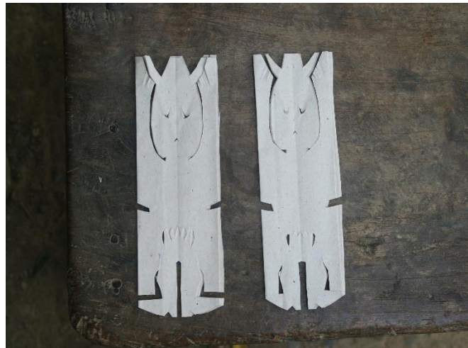
Figure 5. Tlil (fire) female and male from the good polarity.

Carnival). The tlabueliloc is the deity for the Carnival and is associated with the devil. In the photograph other deities are placed underneath the food offerings represented with white newspaper. The color-paper images are the ehcameh (bad-winds). All deities belong to the bad polarity. The photograph corresponds to the event known as tlaochpantli or cleansing rite performed in the chicomexochitl ceremony. The offerings are presented to the ehcameh (bad-winds). Cuatro Caminos, 2011.