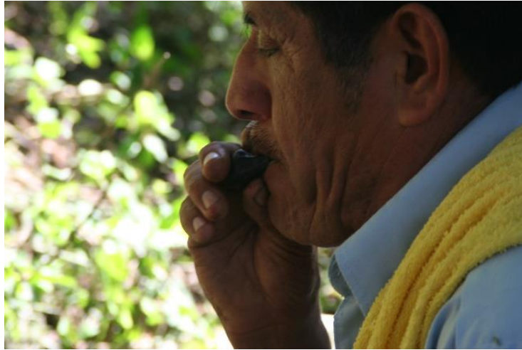
Figure 26. Ritual specialist blowing in a clay whistle. Chicomexochitl Ceremony. February, 2011.

The musicians play the following piece (Figure 27):