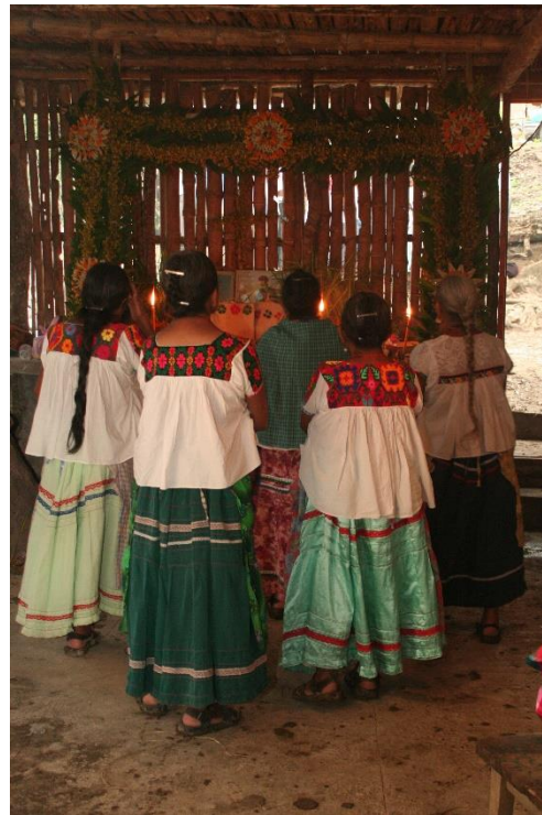
Figure 15. Left. Main table placed on the foothill of the Postectli Mountain. Chicomexochitl ceremony. Ixcacuatitla, June 24 th , 2011.