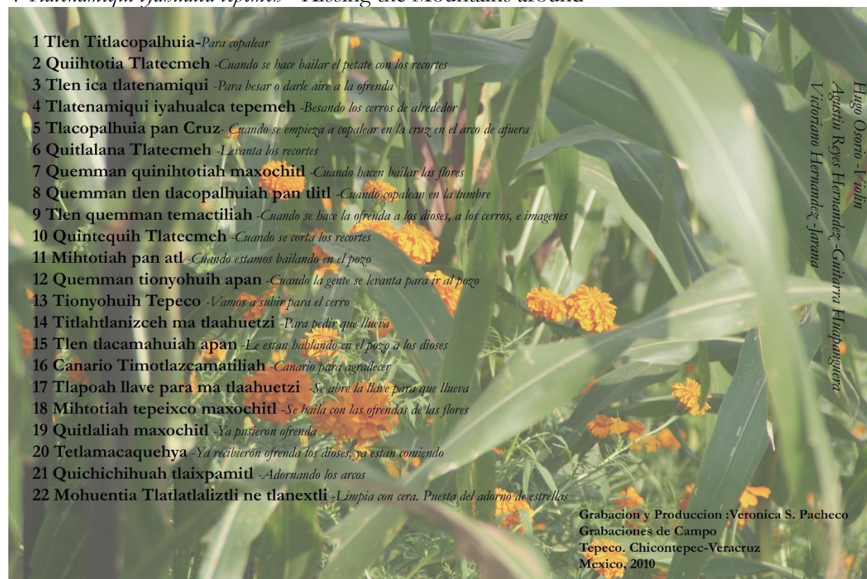
Figure 32. Selection of xochitl sones 1-22. CD cover of the recording made in collaboration with the trio Nuevo Amanecer. Tepeco, 2010.