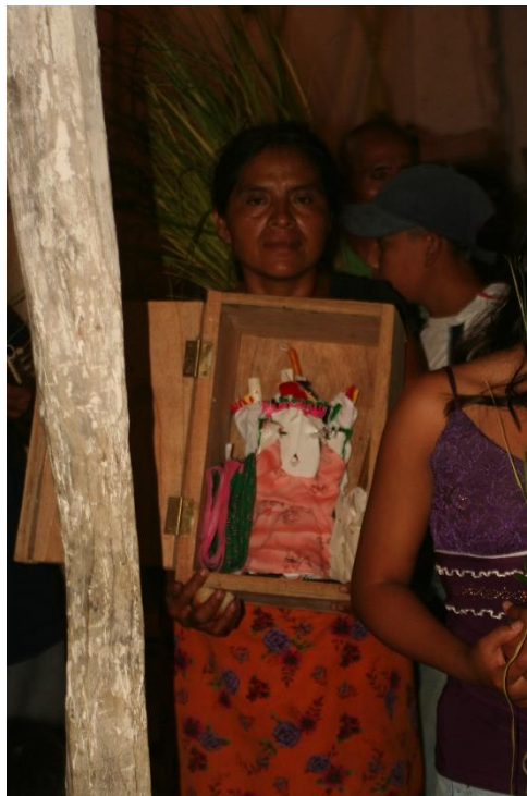
Figure 2. Chicomexochitl deity represented with paper-cut images inside the wooden box. Las Silletas, June, 2011.

president, treasurer, secretary, mayordomo , and comandante (a major or captain). 25 These authorities take care of the temple, including cleaning and changing flowers or other needs as well as organizing religious ceremonies and events. The xochicalli contains three altars, locally referred to as mesas (literally meaning ‘tables’). The main altar holds in the center the image of the corn deity named Chicomexochitl (literally ‘seven flower’) in a wooden box (Figure 2).