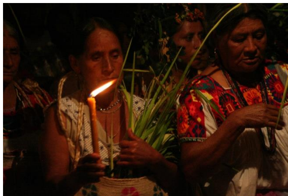
Figure 22. Event 'dancing with the offerings'. Chicomexochitl Ceremony. Ixcacuatitla-Los Pinos, Feb. 2011.

In the early evening of the day, the ritual specialist finishes with all required paper-cut images, in which stage everybody starts to gather around the large petlatl bringing together the offerings in baskets and preparing for the next day. All the baskets are large and are divided according to each table with offerings following the deities' attributes such as numbers for coyol and marigold flowers, and colors for candy and sweet beverages such as juice or sodas. The baskets for deities on the ledge for earth, in addition, contain tobacco, beer, and sugarcane liquor. Moreover, chickens and turkeys for sacrifice are brought and everyone joins in a dance in front of the petlatl carrying the bags with deities, baskets of offerings, and birds (Figure 22).