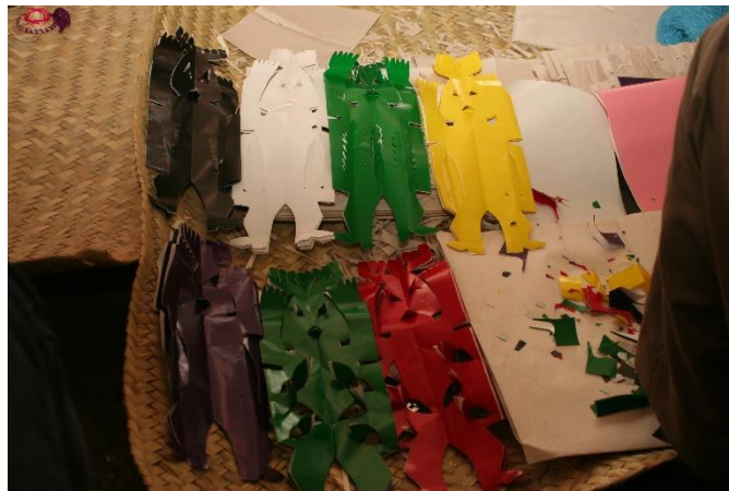
Figure 19. Seven cut-paper images representing the Chicomexochitl deity. Chicomexochitl Ceremony. Ixcacuatitla-Los Pinos, February, 2011.