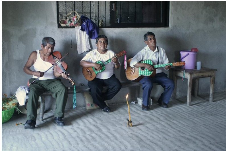
Figure 6. Musicians from the town of Camotipan: violin (left), jarana (center), and huapanguera (right). Chicomexochitl ceremony. Cuatro Caminos, Abril 2011.

Music is a structural part of the tlatlacualtia ceremonies. The ritual music xochitl sones (flower-musical pieces) or sones de costumbre (musical pieces of the tradition), are over one hundred musical pieces organized according to, and named after, the stages or events that take place in the celebrations. The melodies are performed on the violin and accompanied rhythmically by the jarana and huapanguera (Figure 6). There are no lyrics.