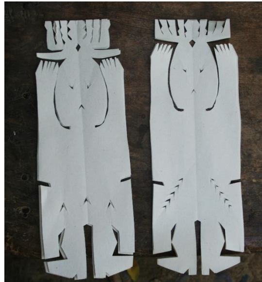
Figure 3. The Sir (left) and Madam (right) of the Mountain from the good polarity.

they belong. In Figure 3, Figure 4, and Figure 5 are some illustrations of the deities and their polarities: