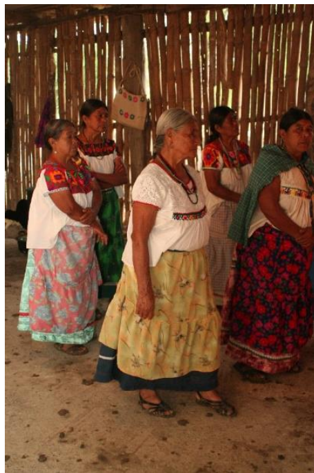
Figure 20. Members of the congregation dancing in the xochicalli . Chicomexochitl Ceremony. Ixcacuatitla-Los Pinos, Feb. 2011.

The ritual specialist shapes the cut-paper images for the petlameh in an order that follows the tables' location starting from the xochicalli temple towards the well, until reaching the last table on the mountain's summit. At this stage, the music is a combination of different pieces that correspond to different events of the whole ceremony, and on occasions these reflect a particular deity that the ritual specialist is cutting. Often a group of elders get together to dance in front of the main altar (Figure 20).