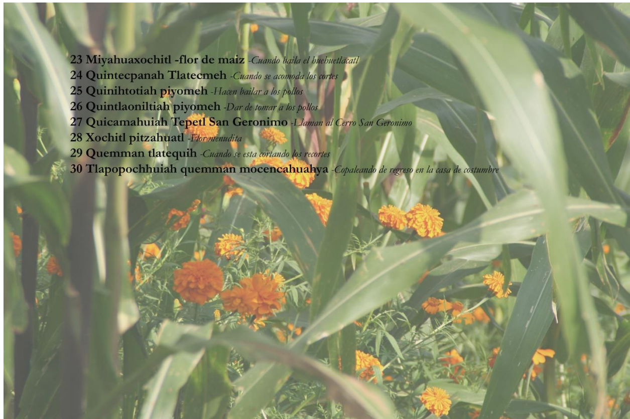
Figure 33. Selection of xochitl sones 23-30. CD cover of the recording made in collaboration with the trio Nuevo Amanecer. Tepeco, 2010.