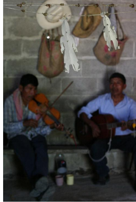
Figure 13. Left. String containing cut-paper images and marigold flowers in the xochicalli . Ixcacuatitla, 2010.