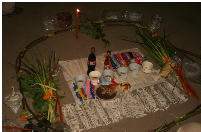
Figure 4. Tlahueliloc , The Sacred Dead, and the ehcameh deities from the bad polarity.

These deities are used in healing practices, in offerings for particular petitions, for protection, and during the tlatlacualtia ceremonies (rain ceremonies offered to the natural landscape). Tepeco, 2010.