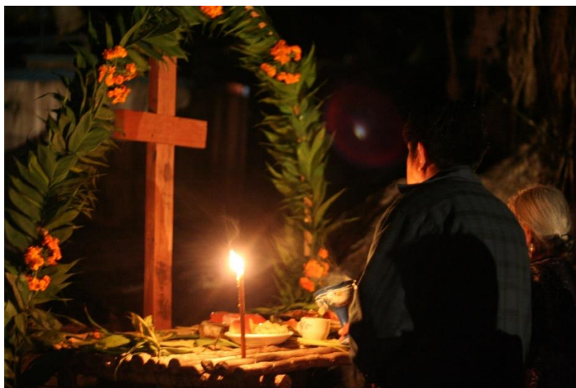
Figure 29. A ritual specialist and a healer offering to the table of the cross. Chicomexochitl ceremony. Ixcacuatitla-Los Pinos, March, 2010.

In the work that the healer performs, divination is a standard procedure to diagnose sickness in patients as well as to set dates for the celebrations. This divination takes place in a cleansing rite. With a system of sixteenth grains of corn, the ritual specialist foresees afflictions as well as past, present, and future experiences of patients, including both their good fortune and their tragedies. The procedure undertaken with the corn also provides information to confirm the dates for the celebration as well as the result of the offerings. The life history of a ritual specialist below illustrates characteristics of la costumbre and the role of music in the context of the ritual. Ritual specialists describe their understanding of dreams and their talent in a fashion parallel to how musicians describe learning to play. The multiple interviews excerpts below correspond to one single ritual specialist. Since the account below refers to a ritual specialist who is also a healer, the term “ritual specialist” is used to identify both roles.