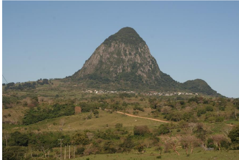
Figure 10. The Postectli Mountain and the town of Ixcacuatitla, 2010.