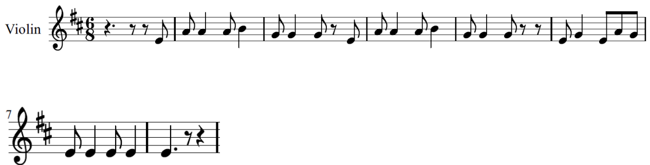
Figure 30. Son ‘to cross the river’. Transcription by the author.

The pieces differ in character. For example, a son used to indicate that the congregation is crossing a river is characterized by a calm rhythm, as if it were indicating the pace to walk (Figure 30):