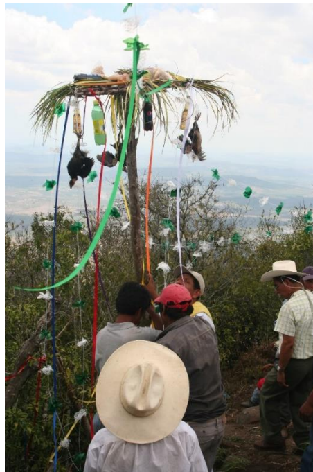
Figure 9. Congregation setting the Crown on top of the Postectli Mountain. Chicomexochitl Ceremony offered by the town of Limon. Postectli Mountain, June 2011.

most deities represented by the cut-paper images, the Chicomexochitl deity is also conceptualized as both female and male. Many of the references of this deity correspond to the image of two children, a boy and a girl, and the deity is also identified as the seeds deity. The chicomexochitl ceremony is offered to mountains with the common belief that these will provide with rain and wellbeing. Figure 9 illustrates the offerings presented to the mountain in the last stage of the celebration when on its summit the congregation raises a pole called Cuayagually (crown). This pole is offered to the sun, and it contains many offerings among which, are a number of baby chickens left to die hanging up-side-down.