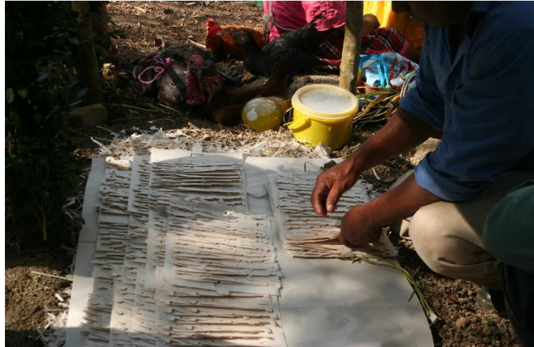
Figure 8. A ritual specialist arranging the cut-paper images. Cuatro Caminos, 2011. Chicomexochitl Ceremony.

Name of the xochitl son : Quintecpanab Tlatecmeh ('when the cut-paper images are arranged')