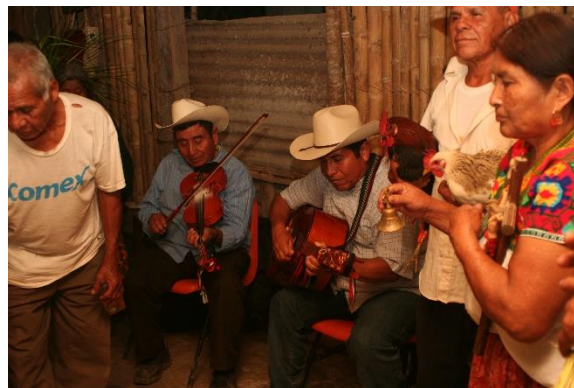
Figure 24. Event ‘dancing of the birds’. Chicomexochitl Ceremony. Ixcacuatitla-Los Pinos, Feb. 2011.

The ‘dancing of the birds’ is characterized by an intense interaction of the congregation (Figure 24). Often people that have donated the birds for sacrifice are the ones that carry the animals and gather in front of the main altar to dance. While the process when the ritual specialist cuts the paper is characterized by silence and calm, ‘dances of the birds’ is a highly contrasting experience since the xochicalli is filled with the loud sound of the trio music, the rattle and the bell, the sounds that the animals produce and those of people talking.