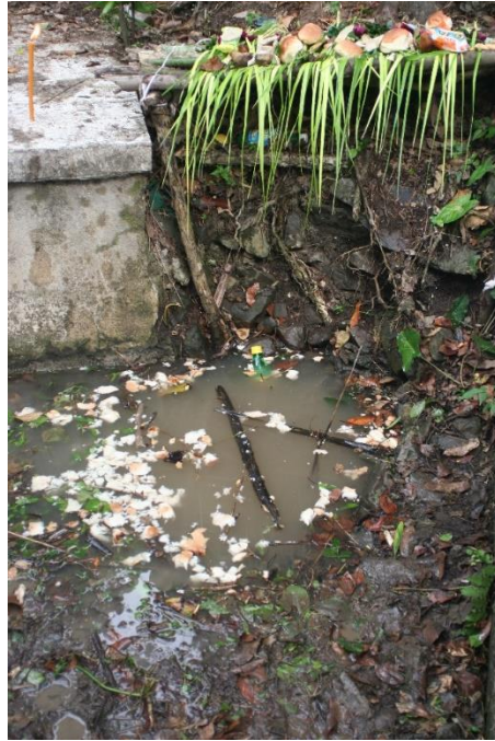
Figure 7. Offering to the water. Chicomexochitl Ceremony. Ixcacuatitla, Feb. 2011.

The commitment of giving offerings represents a balanced agreement between the congregations and the landscape. In this context, some of the musicians refer to the ritualistic music as one of the channels that bridge these two realities, while others believe that ritual music carries forces that are activated during the ceremonies offered to the natural landscape.