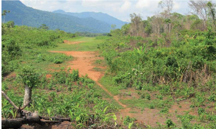
Figure 8: A clandestine landing strip in eastern Honduras used exclusively for drug planes (McSweeney et al., 2014, p. 489)

construct clandestine landing strips and production hubs. Key drug trafficking nodes in eastern Nicaragua and Honduras has seen deforestation at alarming rates, and this has consequently increased the amount of conflict in the area (McSweeney et al., 2014, pp. 489-490).