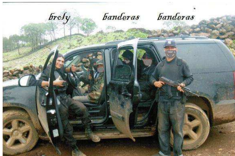
Figure 6: Cartel members strike a proud pose for social media (Nouvet, unknown date)

Jose Rodrigo Arechiga Gamboa, one of the top enforcers for the Sinaloa cartel, was arrested after police pieced together his travel plans from his social media postings. The 23-year-old had over 11,000 Twitter followers, and he routinely used Instagram to boast his luxurious life-style (Kelley & Ingersoll, 2014). Young, impressionable cartel members often post “selfies” showing off their cars, guns, and illicit activities (Figure 6). In doing so, they inadvertently incriminate themselves and sometimes reveal their location. Authorities have been quick to capitalize.