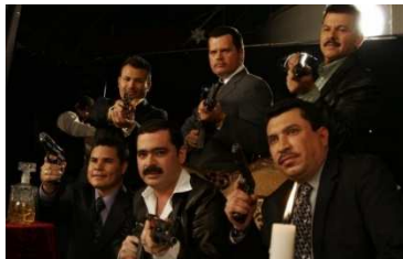
Figure 7: Los Tucanes de Tijuana pose in a publicity photo from 2007 (Ugarte, 2007)

Dicen que mis animales, van a acabar con la gente. Pero no es obligación, que se les pongan enfrente. Mis animales son bravos, sino saben torear pues no le entren (Los Tucanes de Tijuana, 1996)