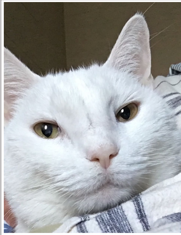
Figure 6 One year follow-up image of the 9-year-old neutered male domestic shorthair reveals marked resolution of facial swelling

deformity is cryptococcosis, although Sporothrix species and phaeohyphomycoses should also be considered as causes for a mass lesion, along with systemic mycotic agents such as Histoplasma capsulatum and Blastomyces dermatitidis . Most of these fungi are readily apparent on cytologic preparations, although non-encapsulated species of Cryptococcus can be more challenging to identify and can result in a false-negative antigen titer. 10 The newly recognized Aspergillus felis is commonly associated with orbital and paranasal soft tissue involvement with mass lesions in the nasal cavity, nasopharynx and oral cavity, as well as orbital lysis, but the Aspergillus species can usually be visualized histologically. 2,11 Atypical bacterial, including mycobacterium and Neisseria -like organisms, can also lead to a similar presentation; however, organisms are more typically identified in aspirates or biopsy samples and can be grown in culture, albeit using a specialized medium. 5,6,12 While chronic rhinosinusitis is one of the most common nasal conditions of cats, 7 and is often associated with internal destruction of turbinates, bony proliferation and external remodeling of the skull are not typical.