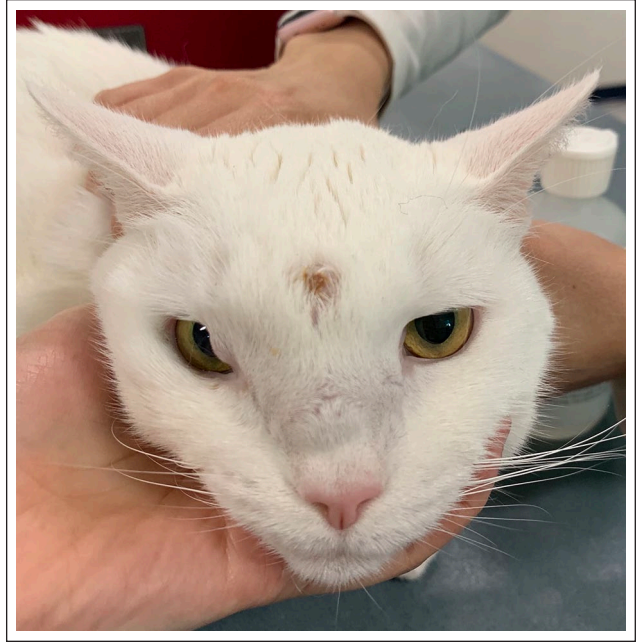
Figure 1 An 8-year-old neutered male domestic shorthair cat had marked widening of the nasal bridge with an oozing biopsy site centrally, facial distortion and an eyelid mass on the right upper lid on presentation to the Oncology Service

Two months prior to referral, nasal CT revealed a centrally hypodense, peripherally contrast-enhancing soft tissue mass dorsal to the bridge of nose, with a defect in the dorsal aspect of the maxilla and nasal bones. A biopsy was obtained externally from between the eyes and revealed severe necrotizing and suppurative inflammation. Bacterial and fungal cultures of the biopsy sample were negative. Fluconazole was initiated, but swelling of the nasal bridge progressed, the suture site began to ooze bloody fluid and a smaller lump developed on the right upper eyelid, prompting referral to the Oncology Service at UC Davis. Physical examination revealed marked widening of the nasal bridge with an oozing biopsy site centrally, facial distortion and an eyelid mass on the right upper lid (Figure 1). The remainder of the physical examination was within normal limits. Feline leukemia virus/feline immunodeficiency virus and repeat cryptococcal