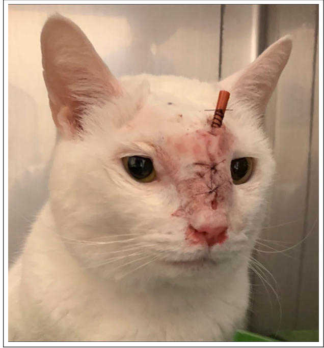
Figure 5 A 6 cm segment of a 5Fr red rubber tube was sutured into the cavity that resulted from debridement of inspissated material from the frontal sinuses

of 4-0 nylon. A 6 cm section of a 5Fr red rubber tube was placed transdermally into the cavity to allow venting of air and was affixed to the skin with a finger trap pattern using 3-0 nylon (Figure 5). Buprenorphine (0.02 mg/kg) was administered intramuscularly twice post-procedure for pain control.