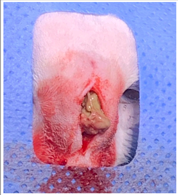
Figure 4 Incision into the mass effect on the dorsal nasal bridge resulted in exudation of thick mucoid material